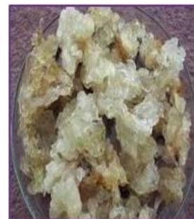
Figure 1: Specimen of grade I Gum Kondagogu

were used and shown in Fig. 1&2 respectively. Diabetes induced by Alloxan was treated by gliclazide which is a potent hypoglycemic drug used in the treatment of NIDDM. The anti-diabetic drug gliclazide loaded pellets coated with gum kondagogu was compared with marketed extended release gliclazide formulation. The results shown in Fig. 3 indicates that on single oral administration of gliclazide loaded pellets coated with gum Kondagogu showed almost similar anti-diabetic activity to that of marketed formulation. The maximum reduction in the glucose level were observed at 4 th and 6 th hour and later the glucose levels were sustained in the same manner similar to that of marketed formulation.