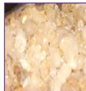
Figure 2: Specimen of Grade I Gum Ghatti