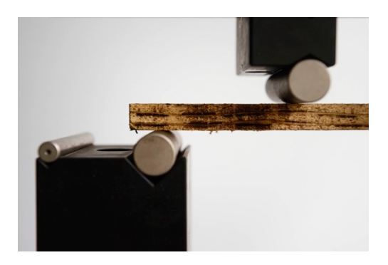
Figure 8. Bending test of mycelium boards at FCL, 2018 © Carlina Teteris.

Learning from the results of this series of prototypologies, KIT, ETH, and FCL produced another load-bearing structure for the Futurium in Berlin in 2019. Here, it was possible to increase the compression strength of the single mycelium-bound building elements significantly in comparison to the MycoTree prototypology from Seoul. This allowed for a slimmer and more elegant structure utilizing varying densities and strengths of the material depending on their respective location within the structure, and thus depending on their structural loads and necessities (Figure 9).