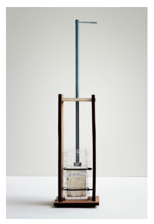
Figure 4. New production tools and methods for improved mycelium growth at FCL, 2017

Following this first application, the research continued by incorporating mycelium elements within the prototypology UMAR (Urban Mining and Recycling) [12], a Swiss housing unit designed by Werner Sobek with Dirk Hebel and Felix Heisel at the Empa NEST in Dübendorf. Here, the material (produced in collaboration with American company Ecovative) was applied as an insulating wall cladding, serving at the same time as base for a loam plaster (Figure 5). Surface characteristics, robustness, and insulation qualities stood in the center of the investigation. Another aspect of the expanded field here became only obvious after the opening of the living unit: Visitors (Figure 6) started to question whether the mycelium material could be dangerous for the inhabitants—associating it with mold. The necessary communication and clarification of the fact that mycelium-bound building elements are dead organisms added another layer of complexity to the project: education.