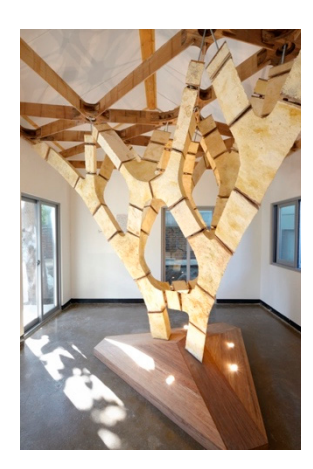
Figure 2. The MycoTree at the Seoul Biennale of Architecture and Urbanism, 2017 © Carlina Teteris.

In January 2017, an invitation to participate at the Seoul Biennale of Architecture and Urbanism in Korea offered the chance to produce a large enough, free-standing structure within an enclosed space. These parameters provided the basis for a prototypology named MycoTree (Figure 2), concentrating on the load-bearing capacities of mycelium-bound building elements while leaving out other questions such as water resistance or longevity [10]. The quickly formed interdisciplinary, intercontinental consortium of KIT, FCL, and the Block Research Group (BRG) of Swiss Federal Institute of Technology (ETH) in Zurich allowed for a very concentrated approach towards the questions how to calculate, form, and produce a spatial branching structure made out of load-bearing mycelium components, which was then produced in collaboration with Indonesian company Mycotech.