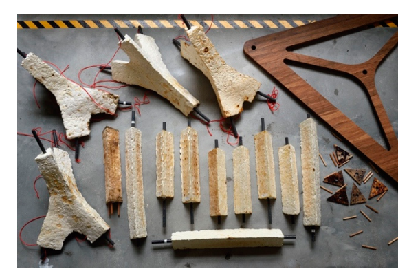
Figure 9. Set of parts for the prototypology Futurium Berlin, 2019 © Carlina Teteris.

Learning from the results of this series of prototypologies, KIT, ETH, and FCL produced another load-bearing structure for the Futurium in Berlin in 2019. Here, it was possible to increase the compression strength of the single mycelium-bound building elements significantly in comparison to the MycoTree prototypology from Seoul. This allowed for a slimmer and more elegant structure utilizing varying densities and strengths of the material depending on their respective location within the structure, and thus depending on their structural loads and necessities (Figure 9).