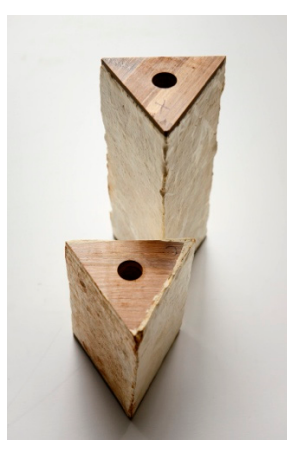
Figure 3. Building elements of MycoTree at FCL, 2017 © Carlina Teteris.

MycoTree's geometry was designed using 3D graphic statics [11], a novel method developed by the BRG that extends the traditional two-dimensional structural design technique to fully spatial systems. Funicular geometry has the advantage that stresses in it are very low. Achieving stability through geometry, rather than through material strength, opens up the possibility of using such weak materials as mycelium. Next to those technological developments, the concentrated work following the prototypological approach required as well an analysis of economic, ecologic, ethical, and psychological parameters of production and use of this new material and construction method (Figures 3 and 4), responding to the expanded view of architectural research Till describes in his treatise.