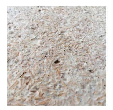
Figure 5. Close up image of mycelium insulation board at UMAR, 2018.