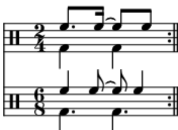
Example 3.4: Tresillo pattern 58

In measures 5-8, Montsalvatge used the tresillo rhythm. Tresillo is a syncopated rhythm found in Afro-Cuban music in \frac{2}{4} time. While this occurs in the treble part of the piano, the voice continues with a steady duple pulse. The steadiness appears in the form which is strophic with a coda. The simplicity of a strophic setting connects the piece with traditional lullabies.