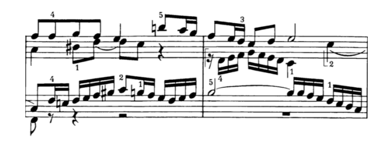
Table I. The Analysis of the Fugue BWV 868