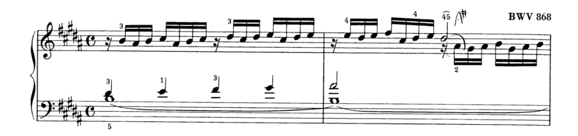
Example 1.1: The Use of the Main Motive in mm. 1-2

Long pedal tones appear as whole notes, mostly in the bass voice. The first phrase starts in B Major at m.1 and ends in a half cadence at m. 6.