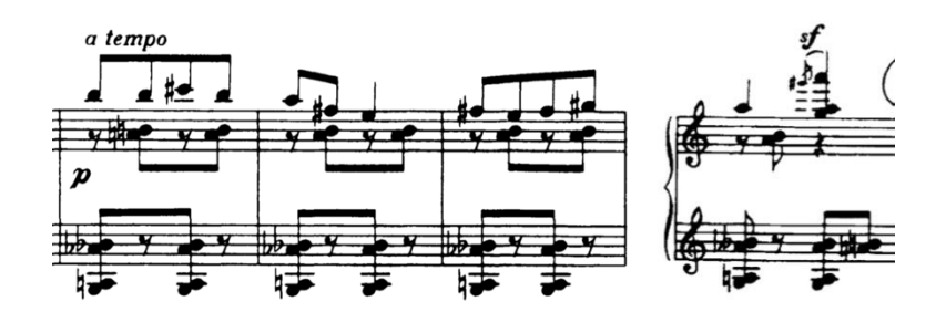
Example 5.10: Motive E from mm. 74-77

An extended version of motive D is heard from mm. 81-91. At m. 92, there is a refrain. The first theme is presented. It is then heard again an octave higher and is slightly altered. At m. 111, there is motive B, which is inverted. At first it is placed in the soprano voice: however, at m. 119, it transfers into the bass line. From m. 127, contrapuntal octave writing and then parallel octave writing takes over. Mm. 137-142 serve as a bridge. At m. 143, there is a second variation of the main theme (motive A). The theme is set in repeated slurs, decorative notes, and again sustains for over a measure at the end of each fragment. The refrain appears at m. 157, and octave passages follow. Motive B is heard at m. 175 in the soprano, then in octave format and contrapuntally. Motive D appears again and is extended from mm. 192-204 with the fast speed of piú mosso. At m. 205, there is the third variation of the main theme (motive A). It is set in slurs again and is decorated. At m. 227 a variant of the refrain appears in agitato. It is set in the high register and is accompanied by heavy broken chords in the bass. At m. 248, the refrain is heard for the last time in a varied form and primarily in octaves. Starting from m. 262, there is a coda. The passages are extremely fast and alternating with measures of chords played on-off beats and slurred measures. The piece comes to a fantastic close.