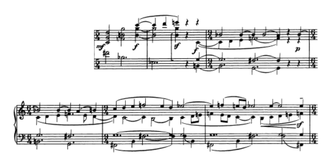
Example 5.5: Motive C and Motive D in mm. 7-12

A variation of the main theme is evident in mm. 13-14 and then again in mm. 15-17 with a varied motive A in the bass. Fragmentation of motive A is shown in m. 19 and continues on. In m. 19 there are also references to motive C in single notes. More writing of the motives occurs until the end of the section. Section II starts at m. 30. This section consists of thirteen measures that increase in dynamics until their climax at m. 42. There are patterns of dissonant chords in the treble register and ascending accented long notes in the tenor voice. The bass line consists of pedal D tones, mostly on off-beats. Section III (or A1)