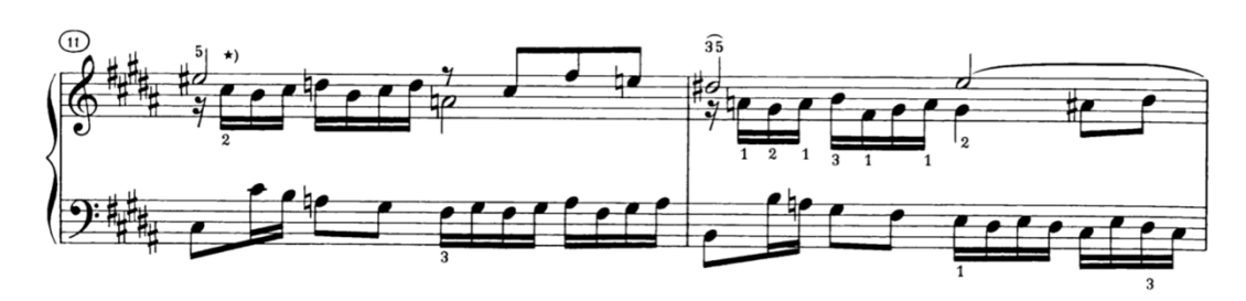
Example 1.2: The Use of Half Notes in the Upper Voices in mm. 11-12

At m. 15, the start of the third phrase, a tonic pedal prepares us for the finale at m.19. At mm. 15-19, the main motif at times appears in the inverted form (Example 1.3). The piece concludes in B major with a perfect authentic cadence.