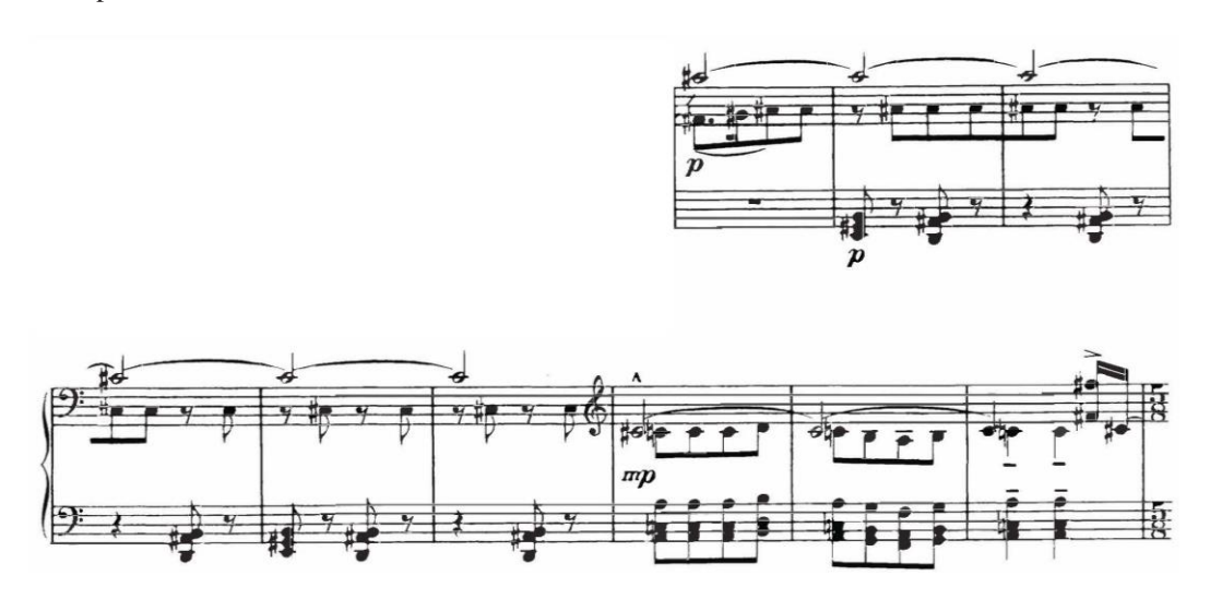
Example 5.3: Imitated Theme in m. 38 and Motive C/Second Theme in m. 44

In mm. 22-25, motive B is repeated, then in a fragmented form (of two notes), and then in an ascending form from m. 25. Some additional ancillary tones are added to motive B in m. 29, and then through fragmentation again, a conclusion is reached at m. 37. Motive A once again appears in m. 38 and brings us to the new motive C and second theme in m. 44.