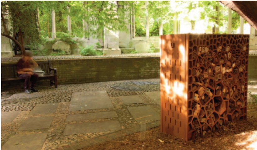
Arup's Nest project provided a type of housing for bees and insects.

camera technology to help with bee conservation and identify when a swarm might be about to move 40 .