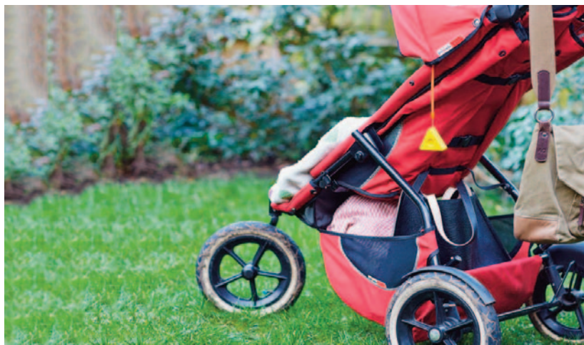
Sammy Screamer, the remote movement monitor by Bleep Bleeps

So far, we have talked about safety in terms of a fixed piece of hardware, but some of them are becoming mobile, moving around our public spaces. For example, rape or personal alarms have also been upgraded by connectivity 21 . Companies like Ignius 22 offer a geolocation aware cardholder or pendant that allows a wearer to report an incident in real-time.