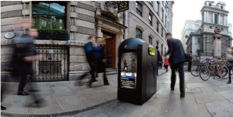
Bins by Renew London which tracked IP addresses.

Seeing a multitude of bins dynamically fill up in a park on a warm day or during an event while accessing the number of people connected to a local Wi-Fi network can help cleaning teams deploy resources very differently than if they see one bin at a time without any extra layer of information.