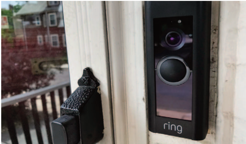
Amazon's Ring doorbell which includes a camera pointing towards the street.

Cameras are also involved in capturing public space without the same stakeholders involved, for example when security cameras installed for domestic real estate use is installed at street level. This also applies to doorbells that have been enhanced with cameras and internet connectivity in the past years to help owners manage visitors, Airbnb guests and home deliveries.