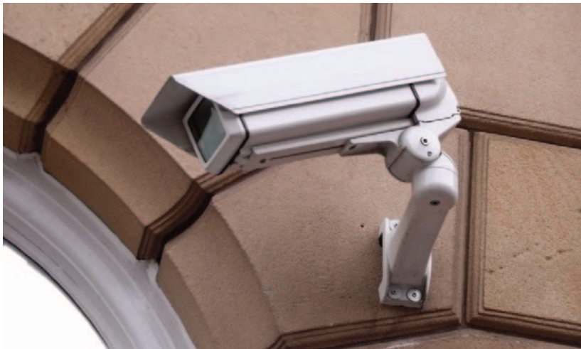
CCTV camera in London

The most well-known use of connected hardware in the public realm relates to issues of safety and security. Depending on the risk profile of a city in terms of political upheaval, terrorism and crime, the major stakeholders (land management companies or owners) will take different approaches to installing connected hardware.