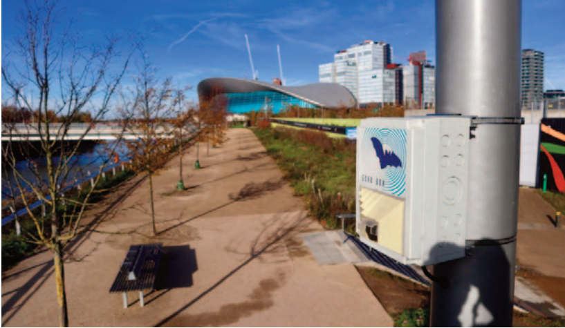
Bat monitors in the London Olympic Park built by UCL CASA

Not every solution is technological or connected. In some parts of the Queen Elizabeth Olympic Park, for example, lower lighting was installed to protect the natural habitat of some animals. This has the power of becoming a solution that is rolled out to parks everywhere, especially in cities where parks remain open at night but should be balanced with the need for safety. Helping people request more light on demand or digitally could help city officials assess the usage of those spaces too and their impact on animals in the area.