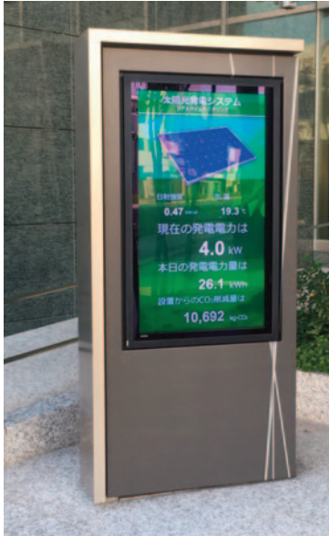
Public display with the energy captured by a solar panel on top of a building in Japan

Not everything that counts can be counted, and not everything that can be counted counts.