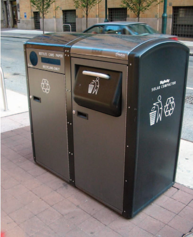
Big Belly solar powered bins