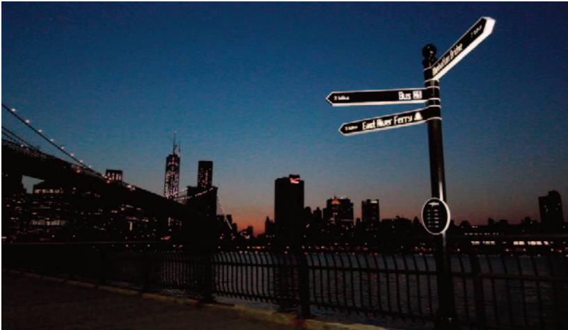
Dynamic LED display developed by design agency Breakfast NYC

Signage and wayfinding in public space hold a dual functionality in making a space both legible and aiding safety. If you don't have a good sense of where you are heading to, you may not want to go there at all. This can be expressed through signs that point in a direction or maps. The gold standard in this area is the IV system 44 by Mijkesenaar at Schiphol Airport, which, with its black Frutiger typeface on a yellow background cuts across its environment and helps passengers at key moments find their way no matter where they are going. As a general principle, the craft of good signage takes a view on how much information to communicate at any given time in a particular context (destination, time it would take to walk, number of meters, etc).