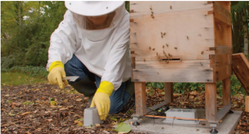
Oracle's Bee Project which tracks the behaviour of swarms in and around a hive

Part of public life that is becoming increasingly important is the preservation and growth of natural spaces and the conservation of urban species. Many non-profits have been working with new technologies to track endangered species 37 , but it's also the creatures closest to us in cities that matter. Many technologically enabled projects are there to help count or protect bees, butterflies, birds and trees.