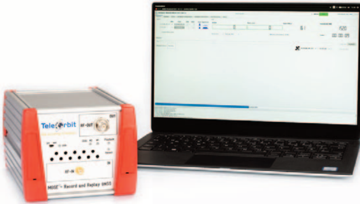
Fraunhofer's system to help the blind using microchips connected to satellite networks.

One of the many challenges of the public realm is offering access to all, no matter what their levels of ability in an environment that is rapidly becoming augmented by technology. From dangling cables to charge electric vehicles to e-bikes and scooters, the pavement of large cities is one of the least accessible places for those with disabilities. These are not new problems, the electrification of cities and advances in telecommunication started the population of our streets with devices. It is however transforming rapidly and for wheelchair users through to enabling access for blindness, tackling these new problems is a challenge. Lack of common sense is hard to police.