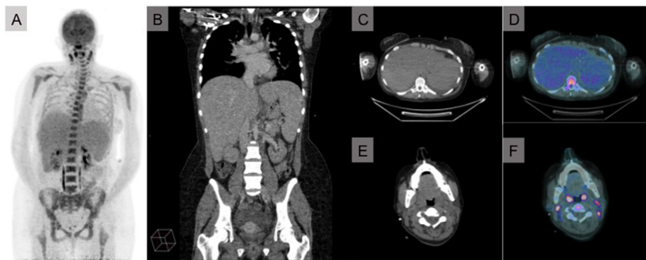
Fig. 1. Images from 18F FDG PET-CT. A. Maximum intensity projection (MIP) showing significant hepatosplenomegaly. B. Coronal view CT showing significant hepatosplenomegaly. C. & D. Axial view CT + 18F FDG PET-CT showing significant hepatosplenomegaly. E. & F. Axial view CT + 18F FDG PET-CT showing enlarged deep upper cervical lymph nodes.

In view of the above investigations, the main differential diagnosis for the patients HLH driver was presumed to be her primary EBV infection in the absence of no other clear diagnosis. In view of this, on day three the patient was given 800 mg of the monoclonal antibody rituximab in addition to the treatment listed above.