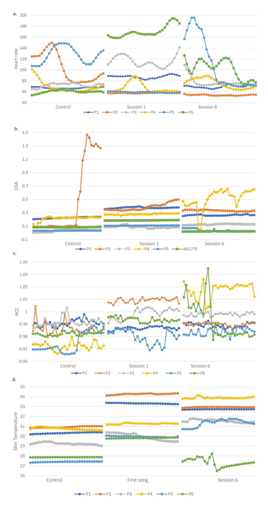
Figure 1. a . Heart rate (HR) of all participants during first song of control and two intervention sessions. b . Electrodermal activity (EDA) of all participants during first song of control and two intervention sessions. c . Accelerometer data (ACC) of all participants during first song of control and two intervention sessions. d . Skin temperature (ST) of all participants during first song of control and two intervention sessions.