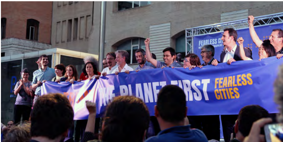
FearlessCities. International Municipalist Summit, Barcelona