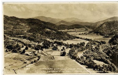
Postcard: Cherokee Indian Reservation, Eastern Entrance