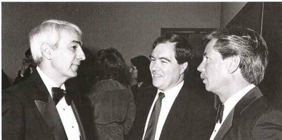
Class of 1976 graduates enjoy their reunion reception in March.

The alumni Board of Directors serves as an advisory group to the Law School and offers educational, social and fund raising activities for students and alumni.