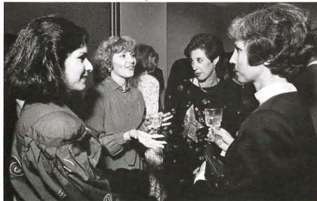
Members of the class of 1976 catch up on news about classmates during the cocktail reception.