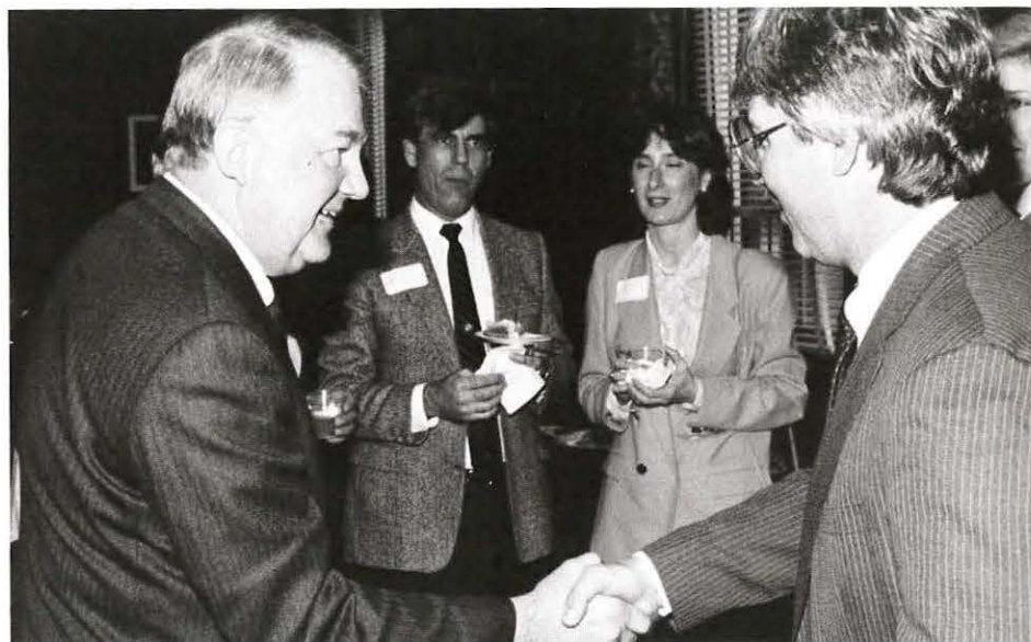
Washington, D.C. area alumni, parents and friends gathered this spring for a reception at the Department of Justice that was hosted by Attorney General Edwin Meese.

The following alumni were instrumental in organizing these receptions: