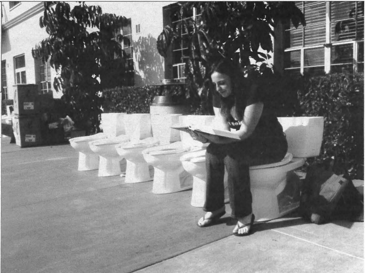
New toilets were installed in Warren Hall recently.

Description: DOORS LOCKED AT 8:00PM SHARP!! Competitors can find more details about the 2010 Write-On by adding our TWEN site, which is already up and running. Adding the TWEN site (2010 Write-On Competition for SDLR, SDILJ, & SDJCEL) will ensure that you receive the most recent information about the competition as well as any e-mails that the competition administrators may send. FMI: usdwriteon2010@gmail.com .