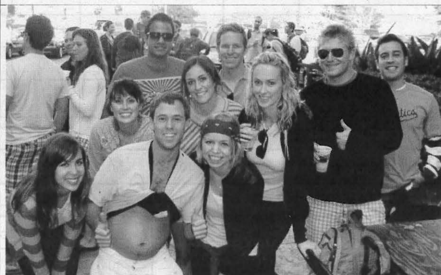
Team Jamaica parties down at the Olympic's Closing ceremonies.

The Public Interest Law Foundation would like to congratulate the winners and thank everyone that came out to support the LRAP program.