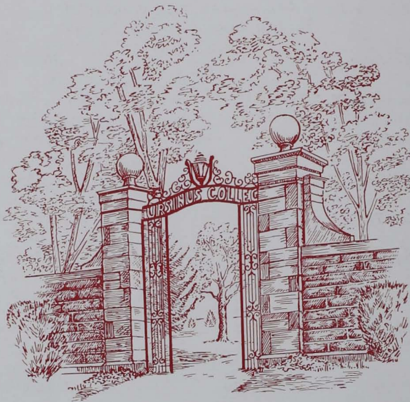
The Eger Gateway