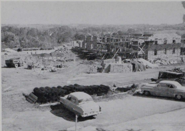
Women's dormitory in early October 1956