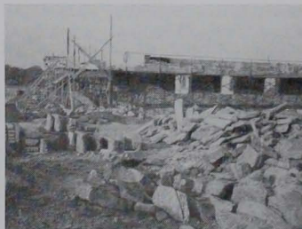
Dormitory September 1956