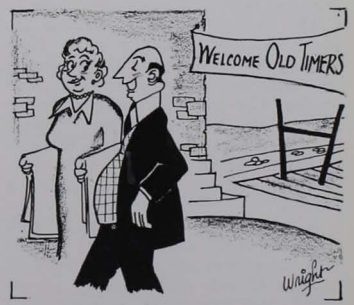
"Did you notice how much older everybody else is getting, dear?"