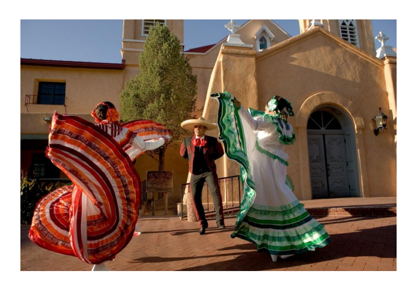
Mexican Ballet Folklorico Dancers http://www.itsatrip.org

Visit the OLAC 2012 website for more conference details: http://olac2012.weebly.com/