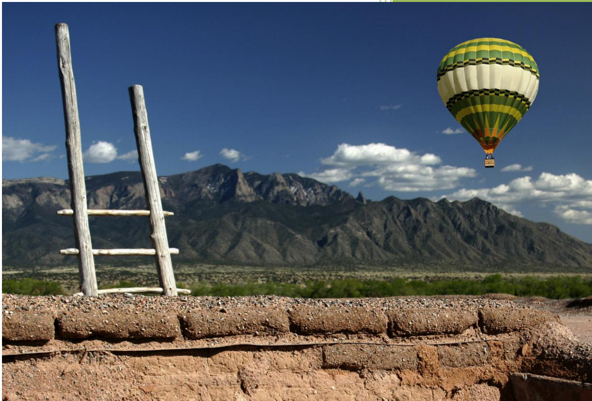
Balloon and Mountain