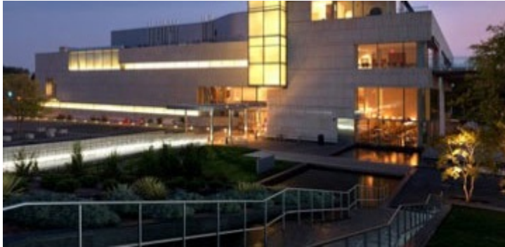
Virginia Museum of Fine Arts (VMFA website)

Impressionist and Post-Impressionist art, British sporting art, Fabergé jeweled objects, and English silver. The museum's holdings of South Asian, Himalayan, and African art are among the finest in the nation.