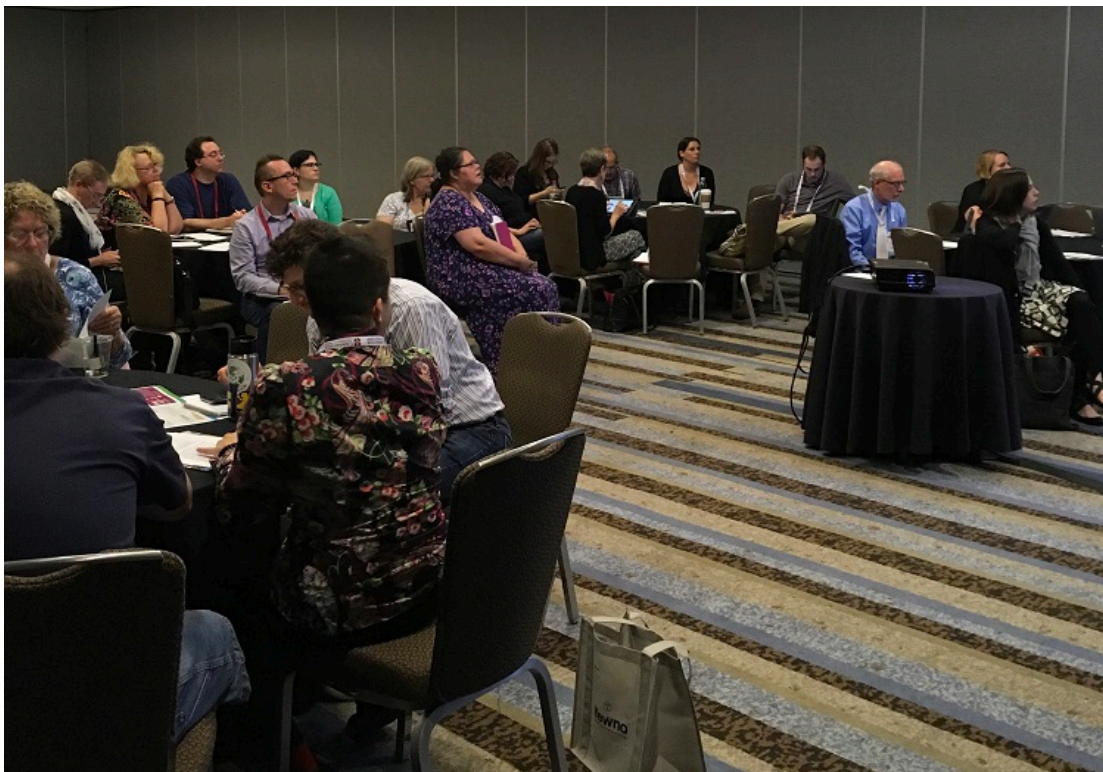
OLAC Membership Meeting