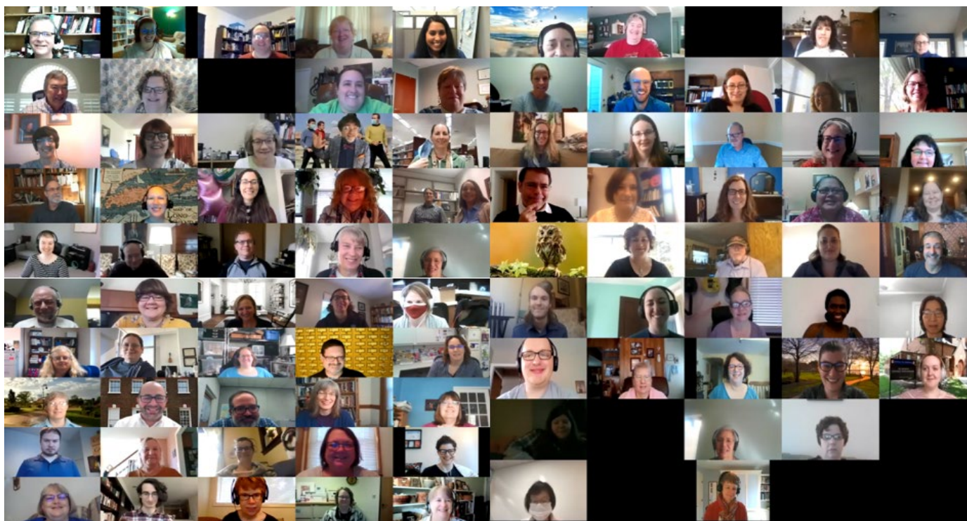
Our Brady Bunch Group Photo during the 40th Anniversary Celebration via Zoom