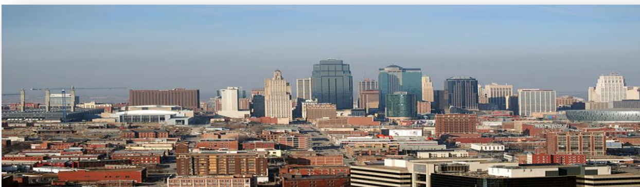
Kansas City skyline