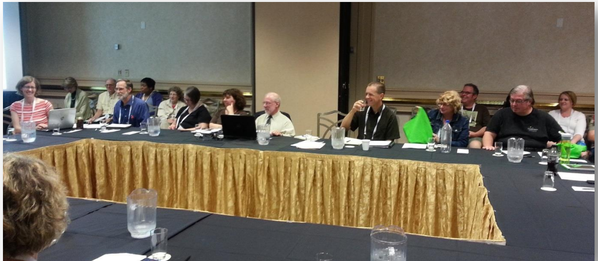
Having a few laughs at the OLAC Membership Meeting