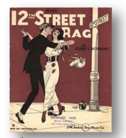
12<sup>th</sup> Street Rag by Euday Bowman

The overall theme of the Joint OLAC/MOUG 2014 conference is A/V Cataloging at the Crossroads , and there couldn't be a better place to meet. Kansas City was founded in 1838 as the Town of Kansas at the