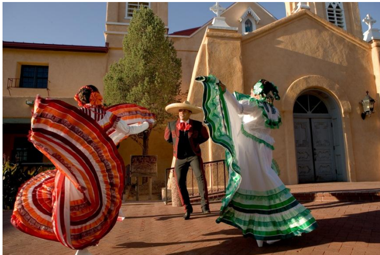
Mexican Ballet Folklorico Dancers http://www.itsatrip.org

Visit the OLAC 2012 website for more conference details: http://olac2012.weebly.com/