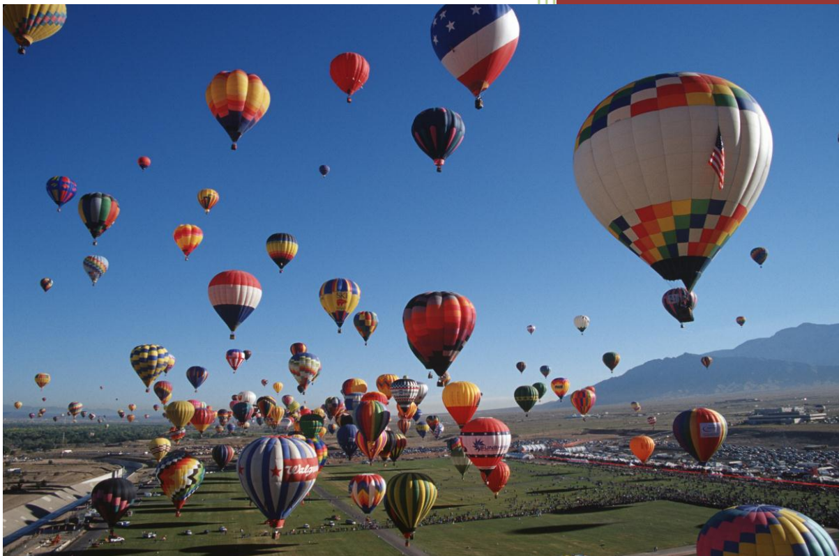
Albuquerque International Balloon Fiesta