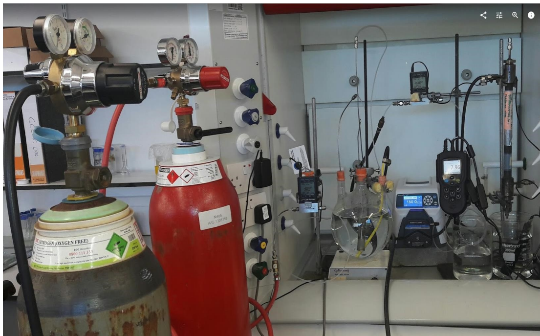
Figure 1: Photograph of the experimental system used in this study.