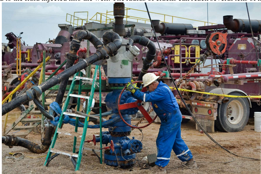
Fig. 1. Installation for hydraulic fracturing.

However, according to domestic ecologists [2-4], as well as foreign scientists [5, 6], one of the most harmful measures in oil and gas production is hydraulic fracturing technology. Hydraulic fracturing is a process that involves the introduction of a mixture of water, sand and chemicals into gas-bearing rocks under high pressure (500-1500 atm) (Fig. 1). This leads to the formation of small fractures, which improve the reservoir properties in the bottomhole zone, which leads to a significant increase in the well rate. All this system of fractures connects the well with the productive parts of the formation remote from the bottomhole. To prevent the closure of cracks after pressure reduction, coarse sand is introduced into them, added to the fluid injected into the well. The radius of cracks can reach several tens of meters.