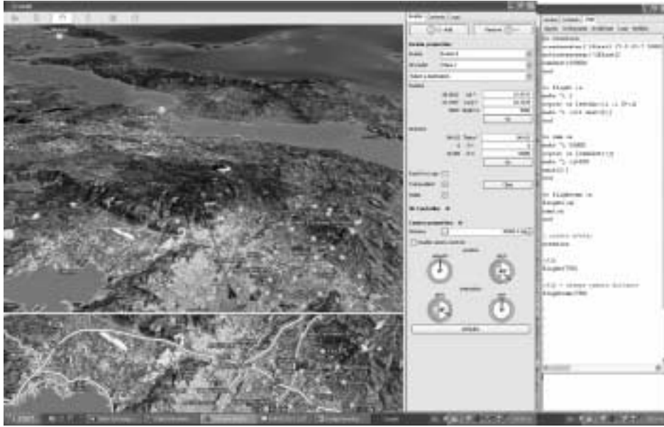
Fig. 4. The 'Cruislet' microworld.