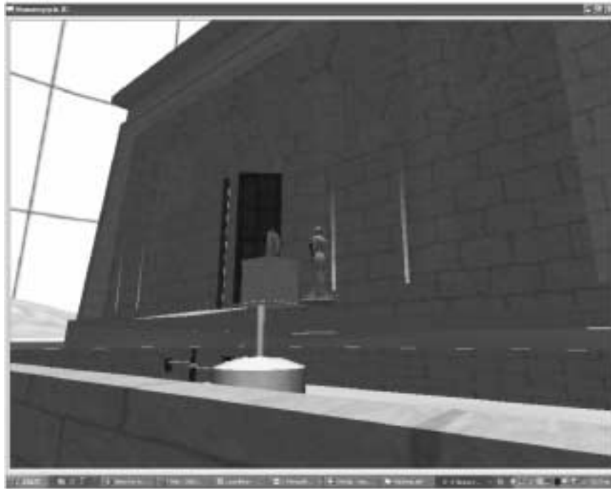
Fig. 3. 'Heron's Automata'.