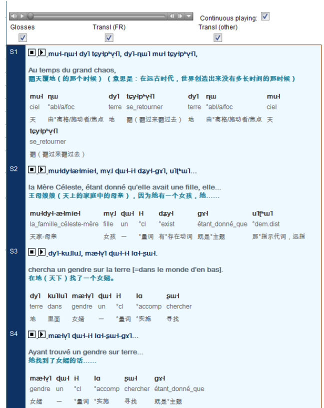
Fig. 3: HTML resulting from application of the XSL stylesheet

The Archive Project browsing and interrogation systems are entirely distinct from the authoring tools. Linguistic documents prepared by the project are browsed and queried using standard browsers through a standard web interface, facilitating their dissemination. The browsing system is relatively stable, but the data management and querying software is in an early stage of development, in part because of a lack of defined standards and hence of standard tools. General searching, word-indexing, and concordancing modules have been developed in prototype form.