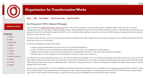
Figure 1. Author guidelines or editorial philosophy? (Screen cap, http://transformativeworks.org/projects/twc-citation. ) [View larger image.]

[2.4] While I was going through peer review and the prepublication process, I was directed by the journals' editors to an essay they had written for the Organization for Transformative Works: "Fan Privacy and TWC's Editorial Philosophy" (Hellekson and Busse 2009). The more I pondered it, the more I found myself thinking that the essay, in addition to outlining the rationale for the journal's editorial policies, was also proposing a conceptualization of acafandom by defining the right ways of doing things for an academic in the field of fan studies, and was doing so by reconfiguring the rules of engagement in what is commonly considered one of academia's essential practices: publication.