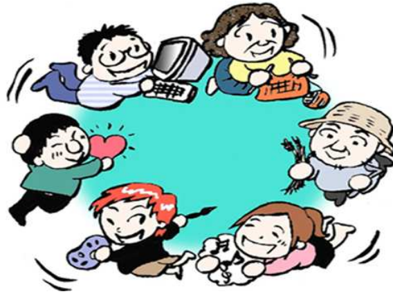
Figure 2. Rethinking the public domain ( http://rights.jinbo.net/english/images/public-domain.jpg ). [View larger image.]

[3.4] Third, the editorial policy suggests that academics in the field of fan studies should treat artifacts and texts found online (images, stories, videos) as if they were human subjects, subjecting their work to the stricter institutional monitoring reserved for research using people. This seems odd in academic settings in which online content is generally considered as discourse and text, and can be sampled, analyzed, and interpreted as such. Yet TWC's editors are suggesting that the dichotomy between representations and people (White n.d.) is a particularly unsatisfactory guiding principle in certain research contexts, such as qualitative research into fan communities by people who are members of that fan community. In such contexts, the boundaries between the observer and the observed are constantly evolving and ceaselessly redefined.