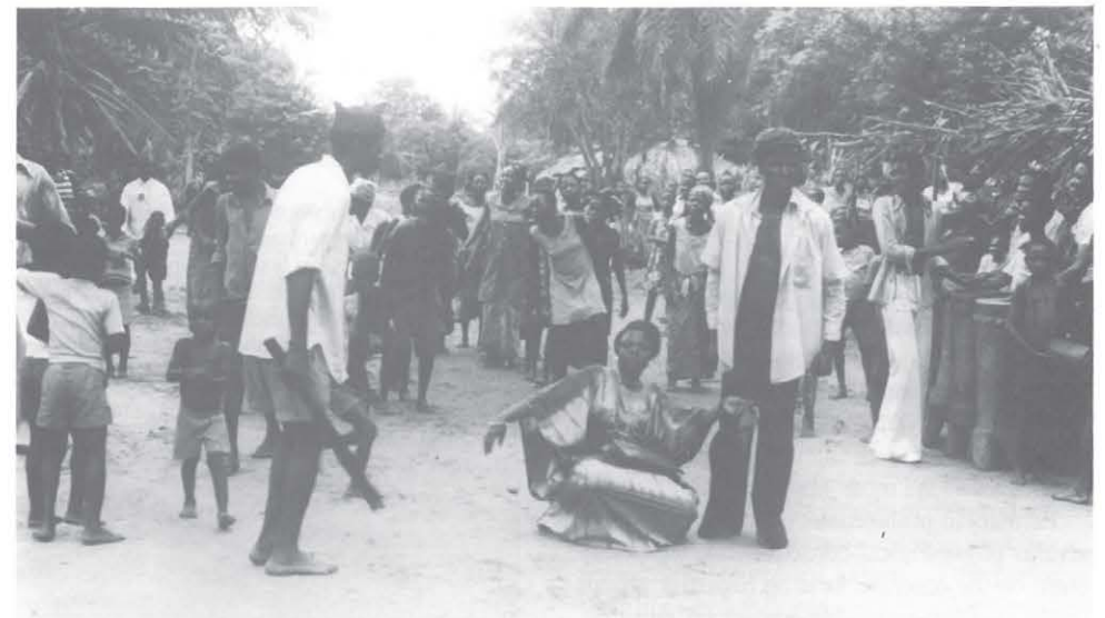
A modern version (inio) of the dance ending the period of seclusion of a primiparous mother, in a Ntomba village of Zaire. She wears a fashionable embroidered long dress instead of the traditional short red one, imported necklaces and bracelets instead of the traditional ones made of brass and cowries, worn with the red ngola wood powder ointment. Seclusion is still considered an important event, even among families following modern life-styles.