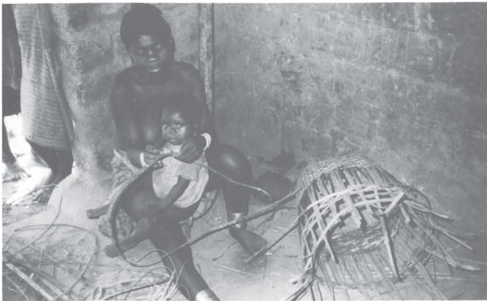
A Ntomba primiparous mother (Twa Pygmy) weaving a basket during her period of seclusion. After several months of total inactivity, the young woman can at last spend her days making the baskets she will need to handle foodstuffs when she rejoins her husband's household and assumes her duties as provisioner of the daily fare.

The Ntomba consist of two distinct populations settled in the same villages, the Oto and the Twa Pygmies (see chapter 2, page 37). They speak the same language and respect the same traditions. With reference to practices surrounding primiparity, a slow evolution can be observed among the Oto whereas the Twa behave as keepers of the tradition.