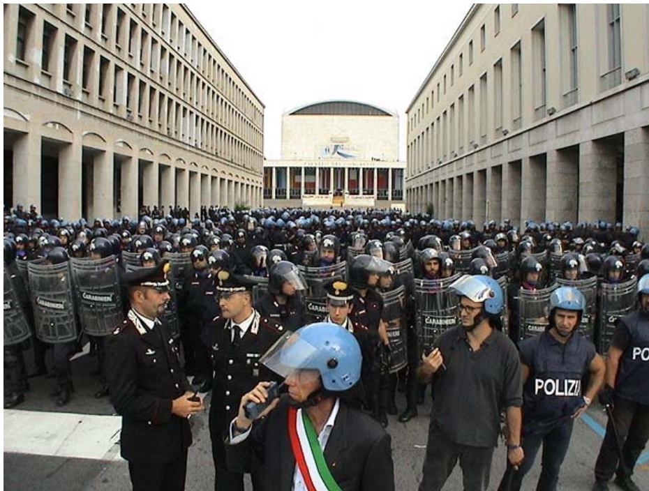
Plate 9. A small percentage of the visible police presence that marked constitutional discussions at the EU 'Intergovernmental Conference on the Future of the Union', Rome, 6 October 2003.