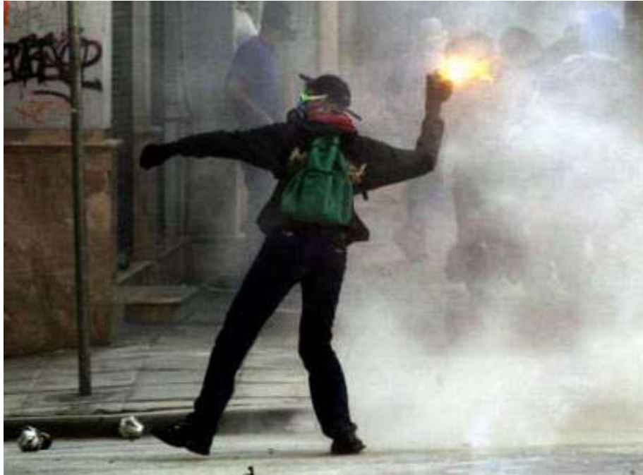
Plate 3. March on Tsimiski Street, Thessaloniki, organised by the Communist Party of Greece as part of the National Day of demonstrations on 21 June 2003 against the EU summit.