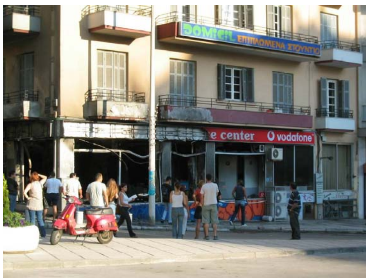
Plate 5. Petrol bombed Vodafone store on Ermou Street, Thessaloniki. Although a number of small, independent businesses were affected by the antiauthoritarian action in Thessaloniki on