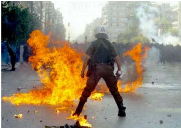
Plate 8. Policeman at the EU summit, Thessaloniki, June 2003.

restrained, unconcerned with the openness and softness of relationship, and built on the disciplined repression of physical needs and desires. This again is reiterated in the particular masculinities of a conventional, humourless and Leninist Left perspective that emphasises the violent necessity of proletarian revolution (e.g. Negri 1984: 73 in Callinicos 2001: 4).