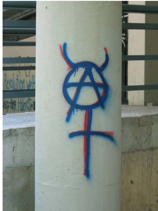
Plate 7. Female anarchist devil – graffiti-ed on the walls of Thessaloniki’s Aristotle University squatted by activists during protests against the EU summit in June 2003.

Indeed a transgressing of the boundaries of ‘polite bourgeois, feminine behaviour’, for example, through participating in confrontational and possibly violent protest, arguably in itself might effect a liberating reconfiguration of the pacified female gender identity that is part and parcel of bourgeois patriarchal social organisation. The symbolic image from Thessaloniki in Plate 7 captures a sense of this going beyond of conventional bourgeois female identities amongst antiauthoritarian protestors.