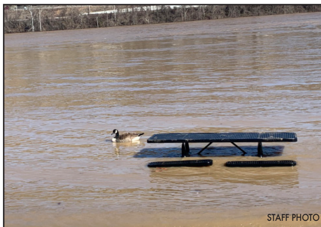
Flooding at Ashland’s riverfront.

Brittany Hively can be contacted at hayes100@marshall.edu .