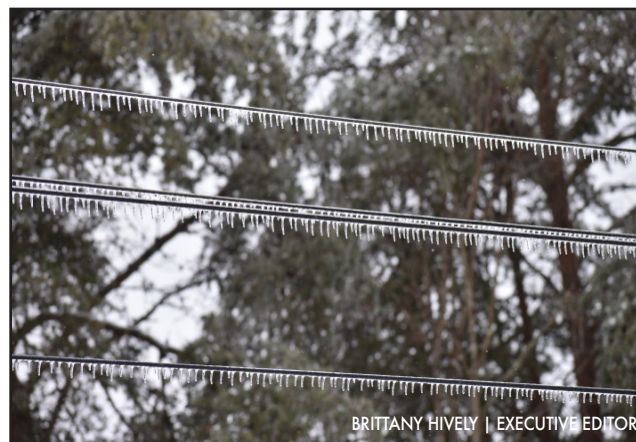
Electric lines covered in ice in Pt. Pleasant.