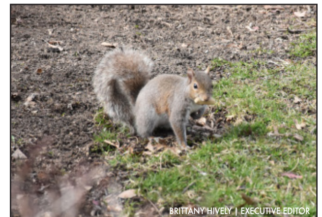
Warmer temperatures bring friendly faces back across campus.