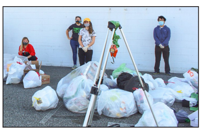
MARSHALL'S SUSTAINABLITY CLUB IS COMMITED TO REDUCING DEPENDENCE ON SINGLE-USE PLASTICS.