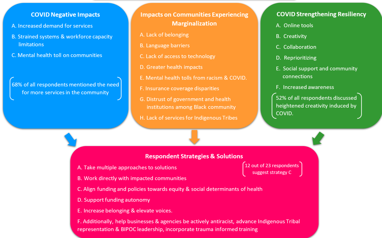
Figure 1. Summary of COVID-19 Impact Assessment Results