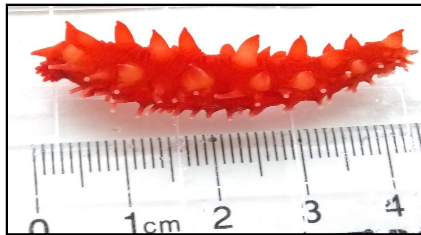
Figure 1: Sea cucumbers juvenile