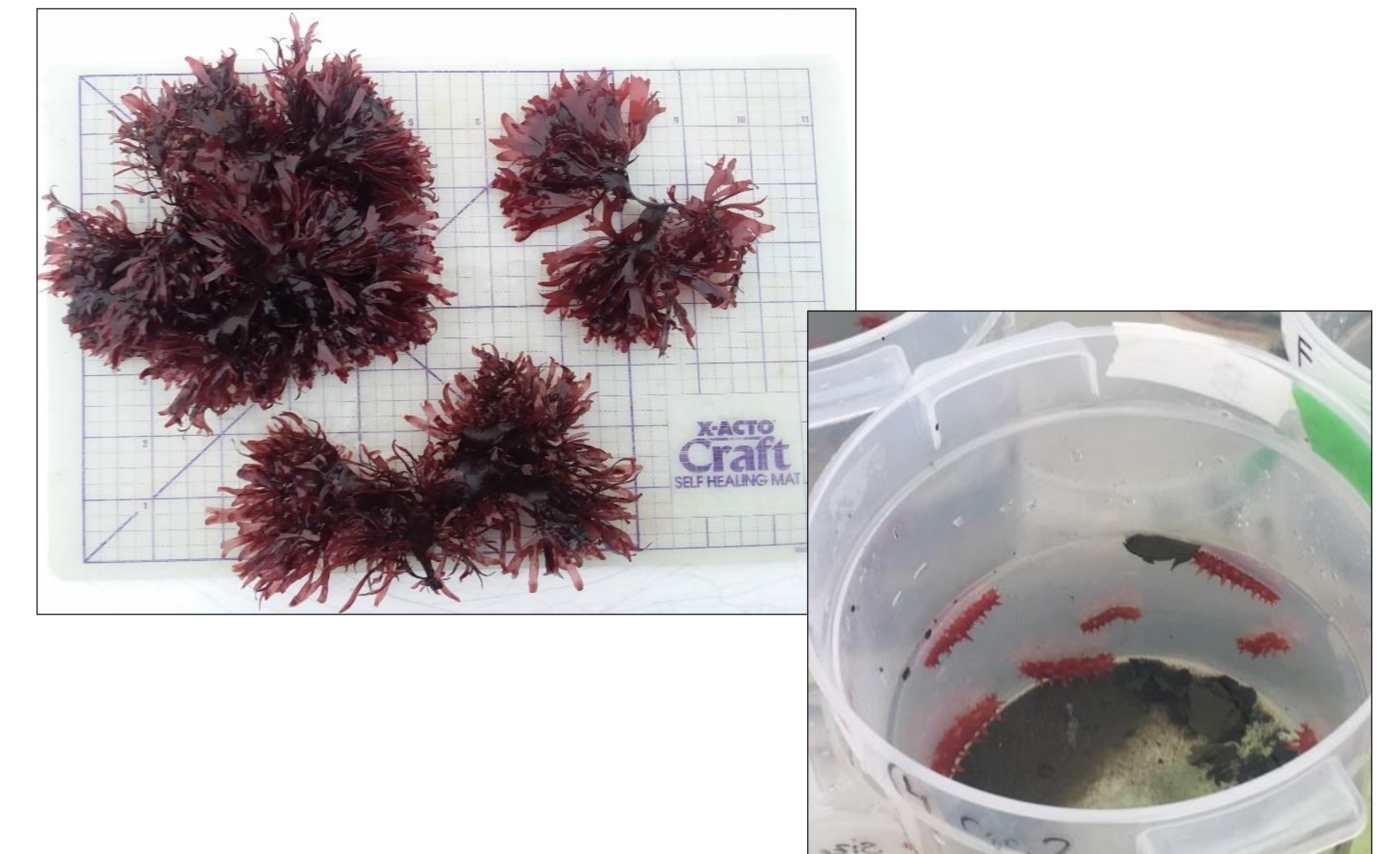
Figures 5 and 6: Dulse ( Palmaria palmate ) grown during co-culture trials and sea cucumber nursery trials comparing mussel waste to seaweed as food sources.