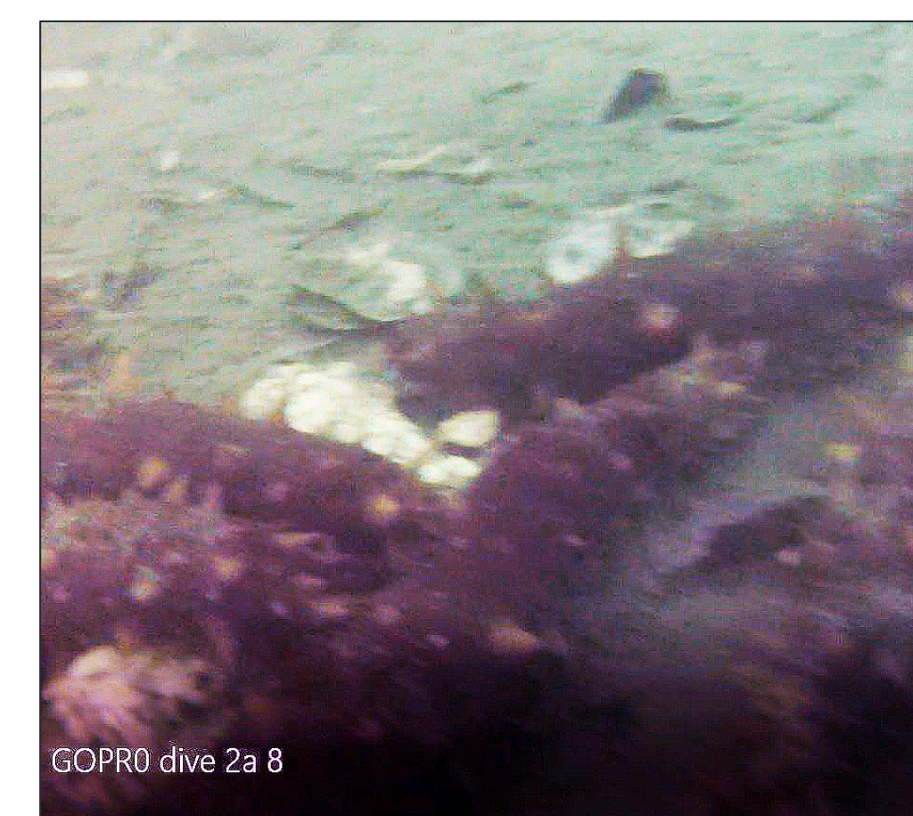
Figure 4: Sea cucumbers utilizing food resources in a mussel farm footprint