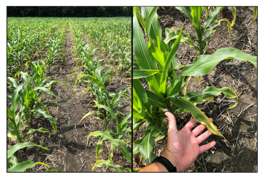
Figure 2. Potassium deficiency symptoms at the beginning of the experiment (July 10, 2020).

KANSAS STATE UNIVERSITY AGRICULTURAL EXPERIMENT STATION AND COOPERATIVE EXTENSION SERVICE