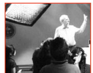
Field Trip to the Public Communications Unit, Downtown Los Angeles

Another department was the Reporter Jobs. They watch television monitors to see what happens in the local media. Media Relations has lots of television monitors to tell what's going on in the media. They want to be able to help the reporters do their job right. The Media Relations Unit is an important department for the City of Los Angeles.