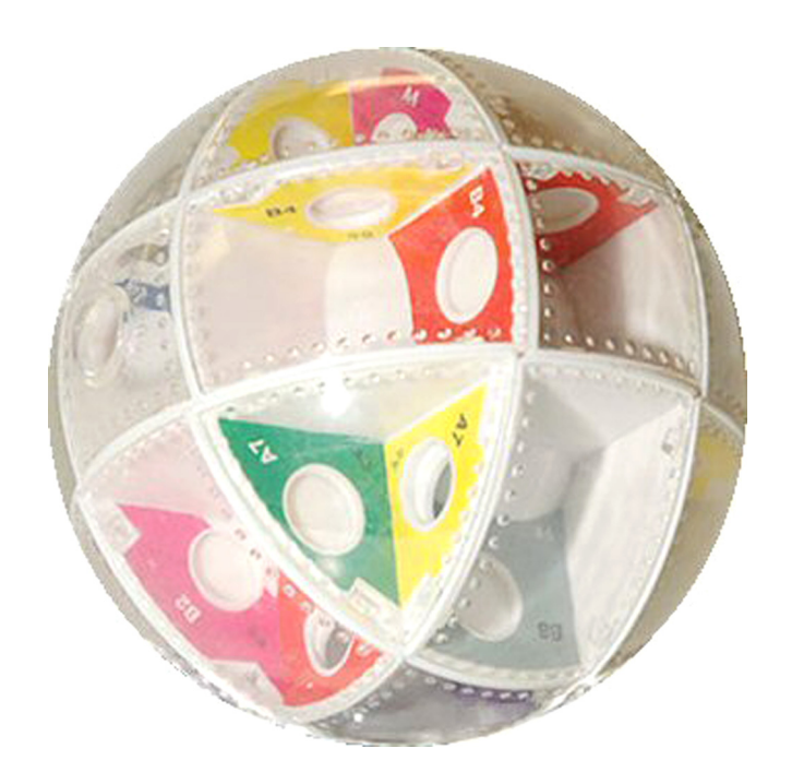
Figure 1 The KO Labyrinth.

The KO Labyrinth , pictured in FIGURE 1, is a colorful spherical puzzle with 26 chambers, some of which can be connected via internal holes through which a small ball can pass when the chambers are aligned correctly. The puzzle can be realigned by performing physical rotations of the sphere in the same way one manipulates a Rubik's Cube, which alters the configuration of the puzzle. There are two special chambers: one where the ball is put into the puzzle and one where it can exit. The goal is to navigate the ball from the entrance to the exit.