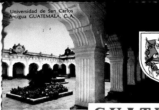
Universidad de San Carlos Antigua GUATEMALA, C. A.