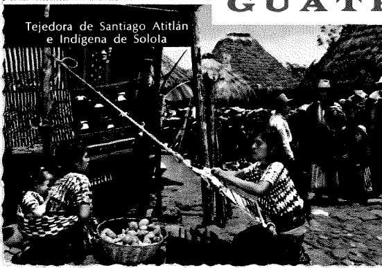
Tejedora de Santiago Atitlán e Indígena de Solola