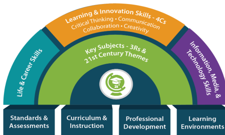
21 st Century Framework

Note. This figure encompasses all aspects of the 21 st Century Skills Framework. From Collaborative Learning