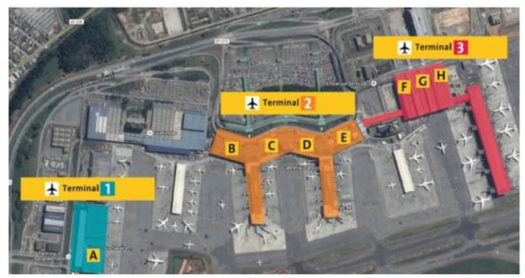
Figure 6 .Guarulhos Airport Map. Adapted from "Aeroporto de Guarulhos perde um terminal", by Meier (2015). Retrieved from https://airway.uol.com.br/aeroporto-de-guarulhos-perde-um-terminal. Copyright 2015 by Meier.

flights, but also some international flights. And in Terminal 3 there are only international flights (GRU Airport, 2017).