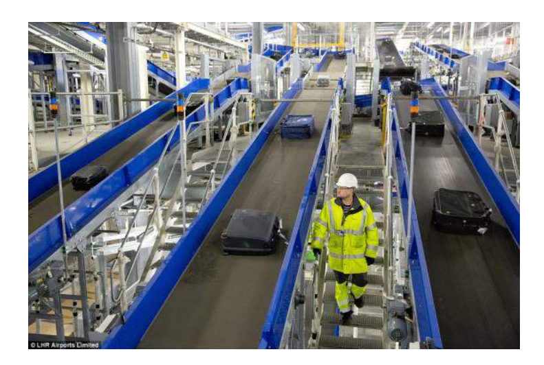
Figure 2 . Heathrow Terminal 5 baggage handling system. Adapted from "Ever wondered what happens to your bag at an airport? Behind the scenes on the luggage conveyor belts of Heathrow Terminal 5", by Duell, 2014. Retrieved from http://www.dailymail.co.uk/ news/. Copyright 2014 by Duell.

Baggage Journey. Schiphol Airport in Amsterdam has the most modern baggage system in the world. Per year, it processes 55 million items (Romero, Quick & Veronezi, 2012). Terminal 5 at Heathrow Airport in London has the largest single-terminal baggage system in Europe. There are 30 miles of haulers at Heathrow – with 2.8 miles of tunnels, 44 baggage retrieval belts and about 53 million bags processed each year. The baggage handling system tunnel cost £ 26 million, but it ensured that all passengers at the airport fly together with their luggage. The baggage journey at an airport passes through several processes, from check in counter to the moment it is delivered to the passenger in its final destination (Duell, 2014).