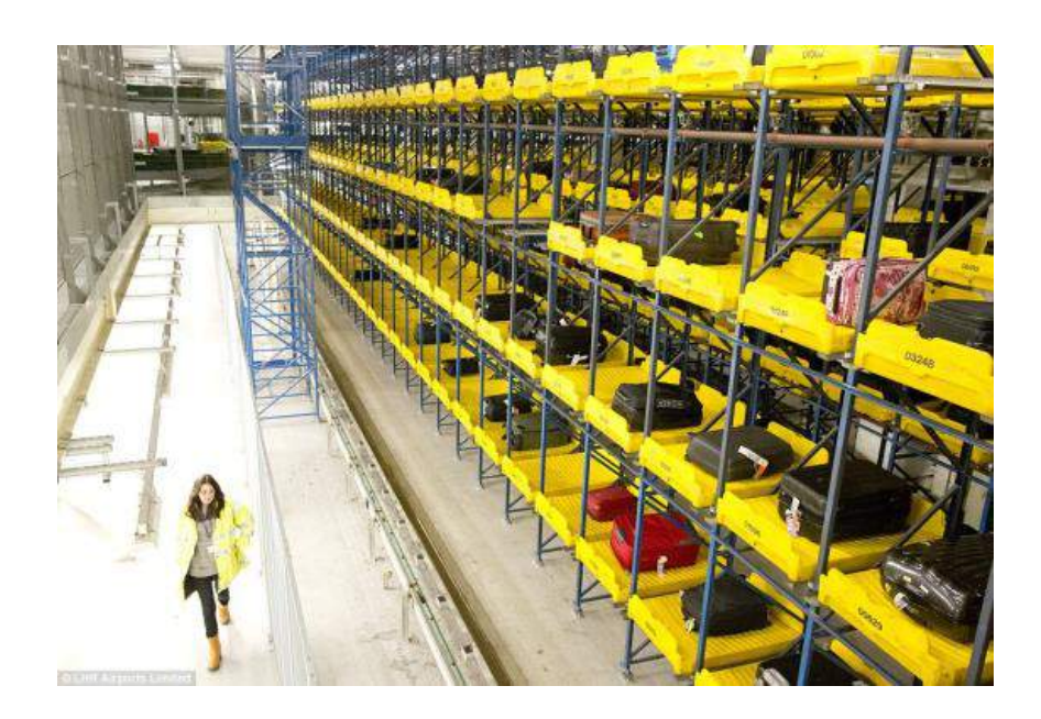
Figure 4 . Heathrow Terminal 5 baggage handling system – Storage. Adapted from "Ever wondered what happens to your bag at an airport? Behind the scenes on the luggage conveyor belts of Heathrow Terminal 5", by Duell, 2014. Retrieved from http://www.dailymail.co.uk/news/. Copyright 2014 by Duell.

plane. The baggage of connecting passengers is loaded by special carriages, which ride at high speed. At destination, the system takes the baggage to the terminal where the passenger landed, after reading the code bar bag tag information. (Romero, Quick & Veronezi, 2012). Heathrow Terminal 5 baggage system can store almost 4,000 items, which are the luggage of connecting customers (Duell, 2014).