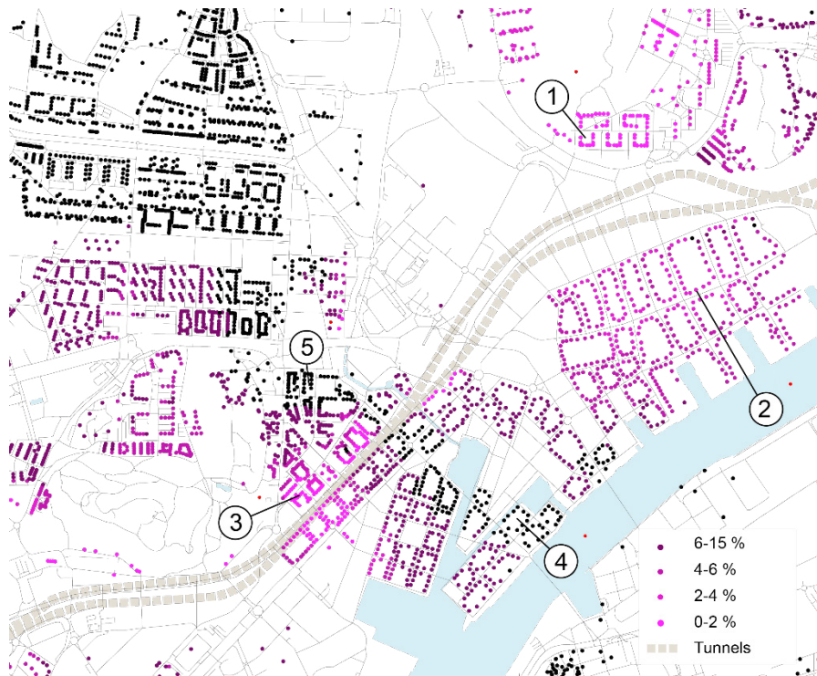
Fig. 1 The increase of proximity on the northern shore of the river Göta in Gothenburg

Fig 1 shows the increase of proximity brought by the tunnel alternative, compared to the present situation. As the maps shows, the increase is distributed in rather irregular patterns over the area surrounding the barriers. The highest increase of proximity is 15 % and is found in Backa (1). This increase in proximity implies that the distance between the residential addresses in this area, and the nearest education facility, health care facility, public transport stop or place with access to water, on average would become up to 15 % shorter. There is also a clear increase of proximity in parts of Ringön (2) and the southern part of Kvillestaden (3). Yet in Frihamnen (4) and the northern part of Kvillestaden (5) proximity stays more or less the same.