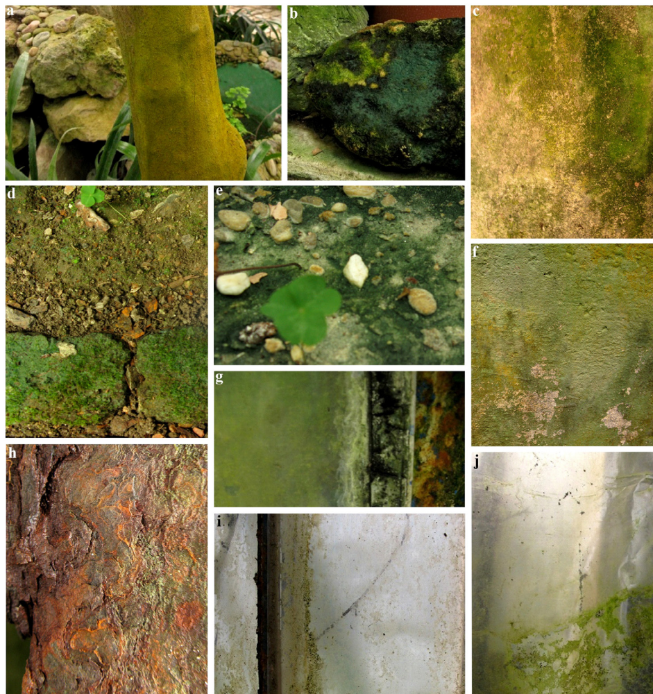
Figure 1. Examined substrata, with visible alterations, from the greenhouse of Botanical Garden “Jevremovac”: a. wood; b. stone; c. mortar; d. clay; e. sand; f. concrete; g. putty; h. metal; i. glass; j. nylon.

Samples for algological and mycological analyses were collected from the surfaces of 10 different substrata with visible SAB formation: wood (Wd), stone (St), sand (Sd), clay (Cl), mortar (Mr), concrete (Co), metal (Mt), nylon (Ny), putty (Pt), and glass (Gl) (Figure 1).