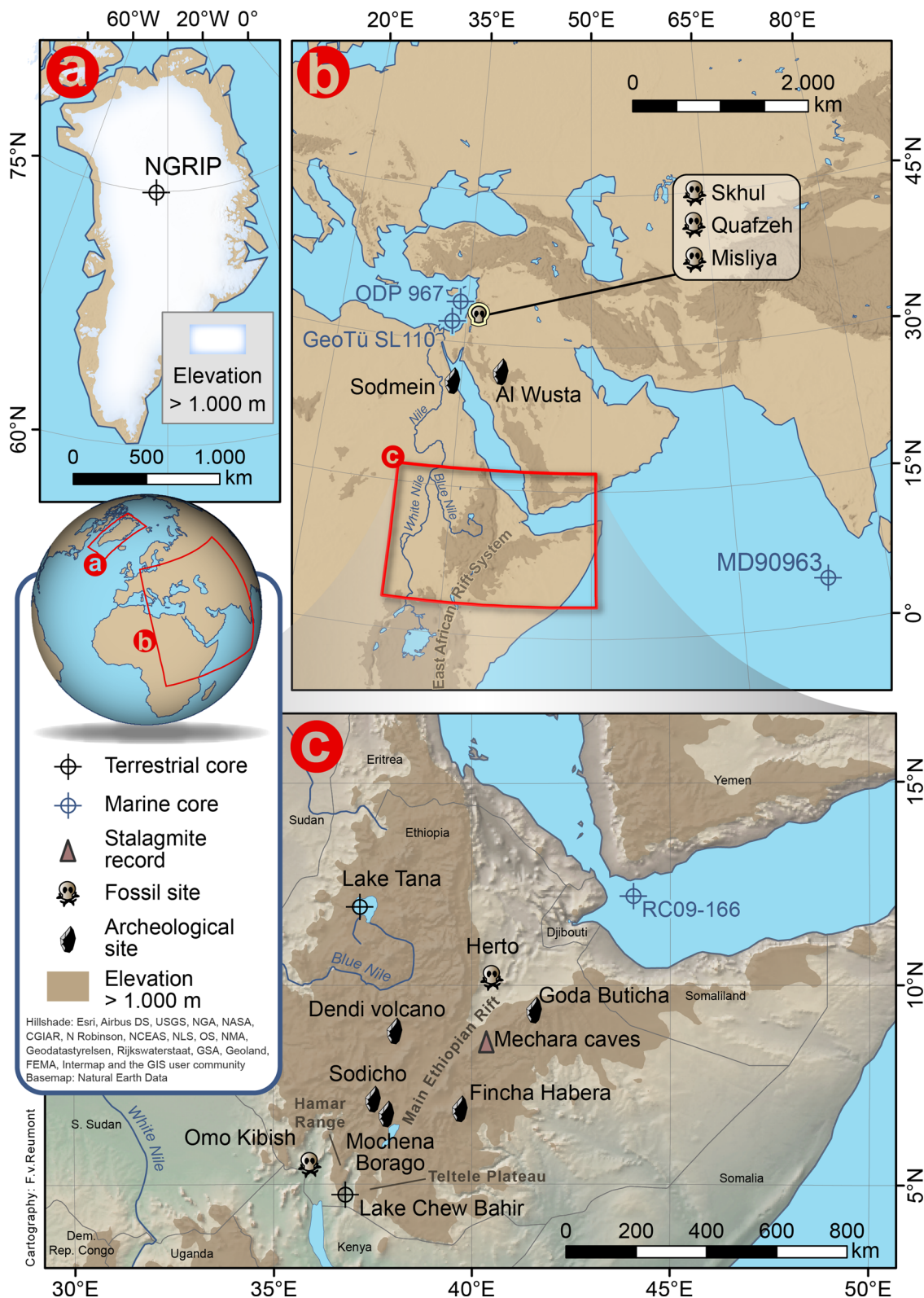
Fig. 1 Location maps. a Map of Greenland and location of NGRIP ice core; b Map of northeastern Africa, the Near East, and southeastern Europe showing important fossil and archeological sites; c Map of northeastern Africa showing the location of the Chew Bahir drill site as well as important fossil and archeological sites. See text for details, data and references.