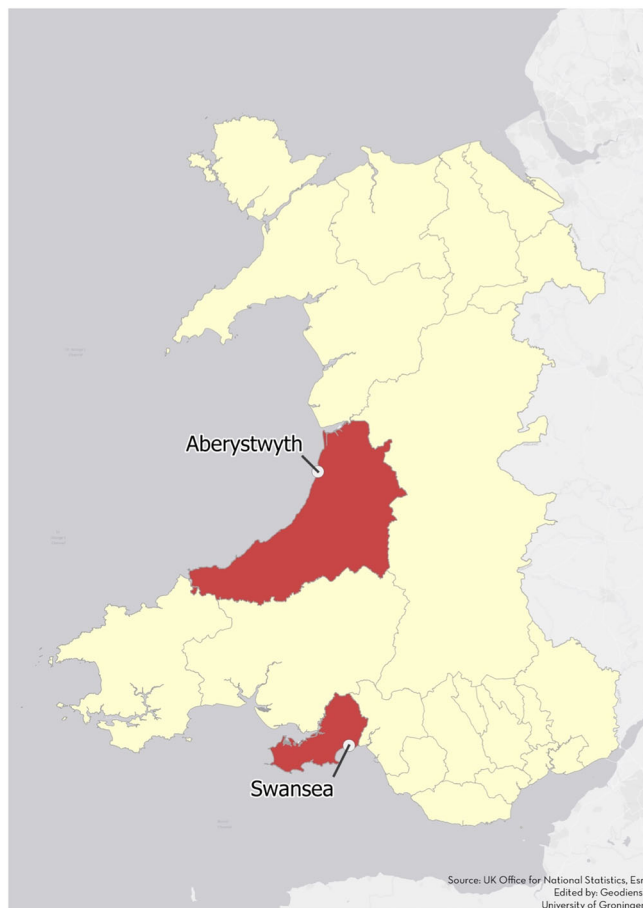
FIGURE 2 Ceredigion and Swansea study areas

We conducted semi-structured interviews with participants from across the four groups: Germans ( n = 13 ), Romanians ( n = 8 ), internal migrants ( n = 19 ), and “stayers” ( n = 19 ). We recruited through mobilising regional networks, advertising, and snowballing, following a quota system to control for gender, age, occupation, and (for migrants) residence length. Interviews were held face-to-face, in English or Welsh, recorded with the participant's consent, and later professionally transcribed. Transcripts were analysed using NVivo, following an iteratively determined coding scheme. Having outlined the research design and method, we now turn to these respondents' accounts of moving to and staying in West Wales and the Valleys.