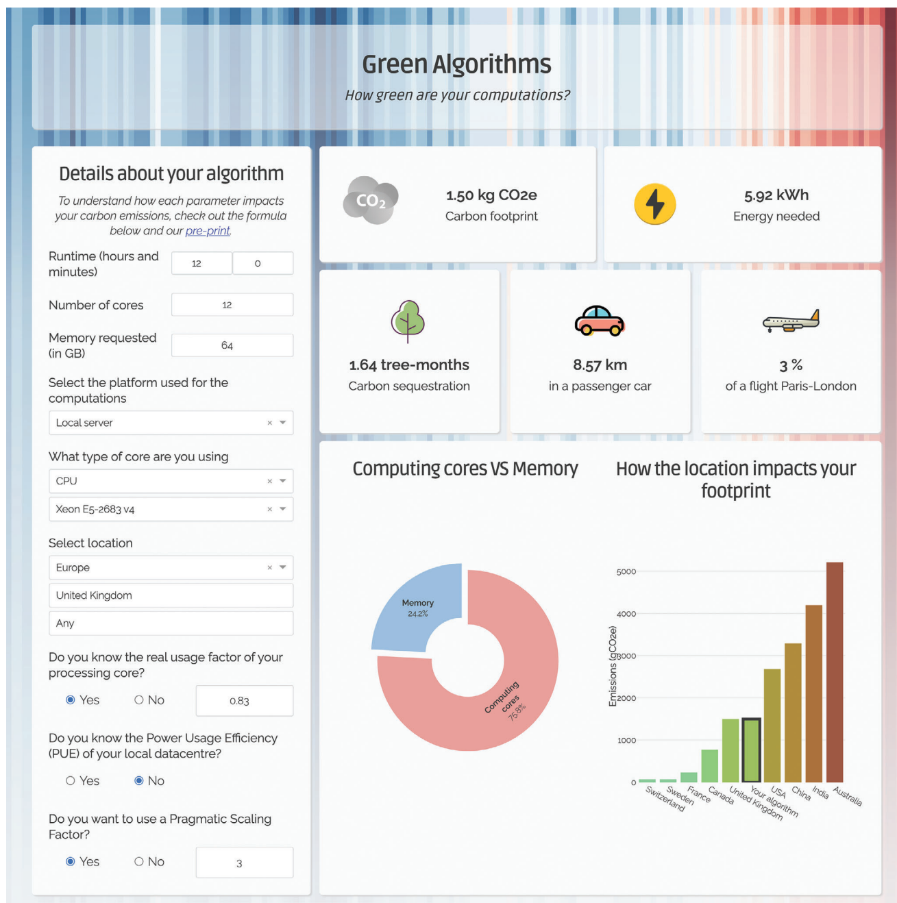
Figure 1. The Green Algorithms calculator (www.green-algorithms.org).

experiment runs for three weeks to simulate 5000 particles (protons) using 24 processing threads and up to 10 GB of memory. Using the Green Algorithms tool, and assuming an average CPU power draw (such as the Xeon E5-2680, capable of running 24 threads on 12 cores), and worldwide average values for PUE and CI, we estimated that a single experiment emits 49 465 gCO 2 e. When taking into account a PSF of 11, corresponding to the 11 different energy levels tested, the carbon footprint of such study is 544 115 gCO 2 e. Using estimates of car and air travel (Experimental Section), 544 115 gCO 2 e is approximately equivalent to driving 3109 km (in a European car) or flying economy from New