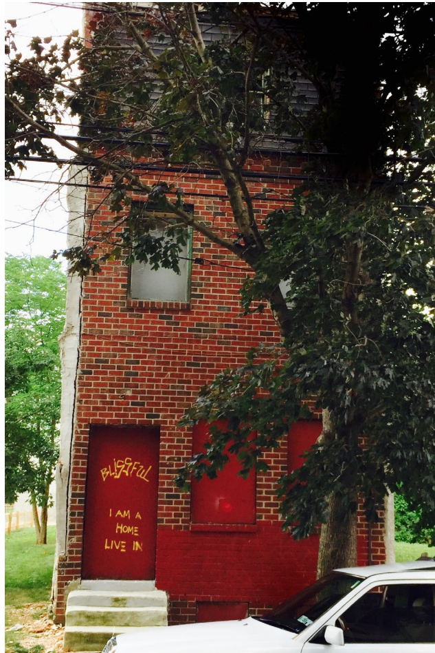
FIGURE 3 Photo taken in Sharswood, Philadelphia by author (2017)

In the summer of 2017, I participated in a mapping workshop, “You are Here,” that Black Quantum Futurism had organised as part of Philadelphia Assembled , a citywide community art programme. The workshop centred on the ways that “maps have been used to disempower people and communities and how they can be used as liberatory and revelatory tools” (Phillips & Ayewa, 2017, n.p.). As part of the workshop, participants created a sound map of Sharswood – near where the Norman Blumberg Apartments used to stand – following the sounds of cars backfiring, footsteps on the sidewalk, laughter at a block party, and silences of the spaces emptied by the Philadelphia Housing Authority redevelopment plan. In making the map, we walked past a boarded up, lone row house – the houses on either side had been demolished – and on the door someone had spray-painted: “Blissful: I am a home / LIVE IN” (see Figure 3). This message struck me as exemplifying what radical speculative (counter) cartographies of property might communicate. Description and imperative, this could be a message from “a post-scientist sorting artifacts after the end of the world” – to draw on the language of Alexis Pauline Gumbs’ “speculative documentary” – highlighting the multiple “realities we are making possible or impossible” every day (2018, p. xi). It suggests a reclamation of past and future, where “vacant” property is reframed as (be)coming “home,” where we might (once again) blissfully “live in.”