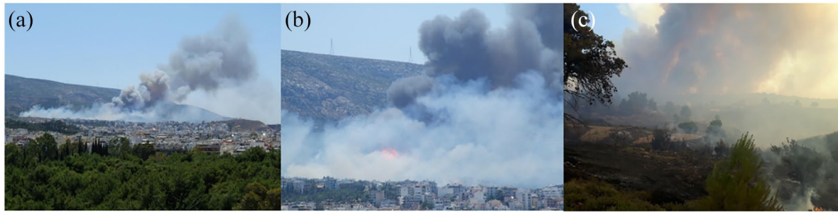
Figure 1. (a) A peri-urban fire on Mt Hymettus, in the outskirts of Athens, on July 17, 2015, with one fatality, (b) a peri-urban fire on Mt Hymettus, in the outskirts of Athens, on July 17, 2015 (detail), and (c) fire in the rural area of Kalamos Attica Greece (summer 2017).

area burned since 1991 was around 447 ha but only 283 ha between 2009 and 2018. Nevertheless, 2018 had the second highest forest area burned since 1991. The average area burned per fire generally around 0.5 ha. The current regional hotspot of wildland fires is in the region of Brandenburg with more than half of the area burned during the largest fires in 2018 (725 ha burnt only in August) and almost three times more than in the dry summer of 2003 when approximately 600 ha of forest has burnt in this federal state. This region is very prone to wildland fires as it has large proportion of connected forest area (44% of the forest is under protection, LFU Brandenburg), which are formed by pine monocultures on sandy soils, a particularly dry and flammable forest type. Since the industrialization, changes in forest management in several regions of former Prussia have replaced some of the previous and less-flammable forest dominated by deciduous trees (Dietze et al., 2019) by pine monocultures. This deep transformation was only possible by strong intervention into the hydrology, for example, building drainage ditches, which now are increasing drought problems, and thus fire susceptibility, in the mid mountain ranges.