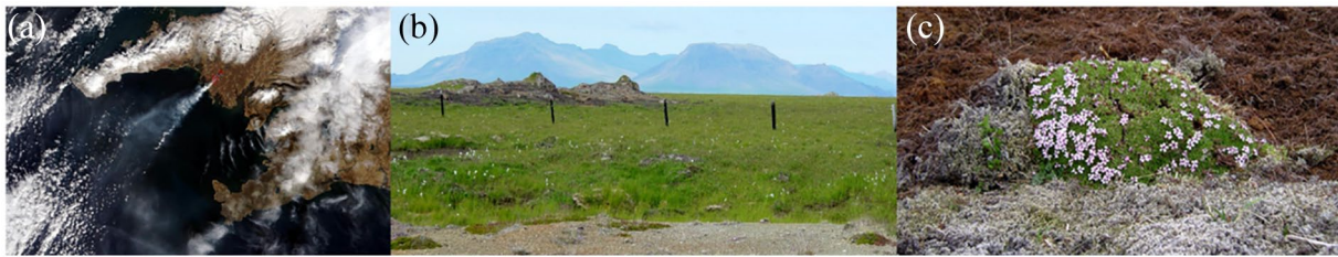
Figure 2. (a) The Myrar wildland fire on 30 March 2006 at 12:55 (image from NASA/MODIS), (b) Myrar 24 July 2006, and (c) edge of a moss fire in June 2007 (Photos: Throstur Thorsteinsson).

lowland coniferous plantations, fire damage can be significant (Szatmári et al., 2016). Human-induced fire, which is generally ignited unintentionally, is the major cause of wildland fires. Arson, for example, affects approximately 10 000 ha of grassland per year (Deak et al., 2014). Prescribed burning is scarcely applied due to legislative constraints, even though in grasslands it may present a feasible solution for several conservation challenges, for example, for increasing landscape-scale diversity, creating habitats for specialist species or for decreasing the amount of accumulated litter (Deak et al., 2014) and also for the protection of the endangered great bustard (Végvári et al., 2016).