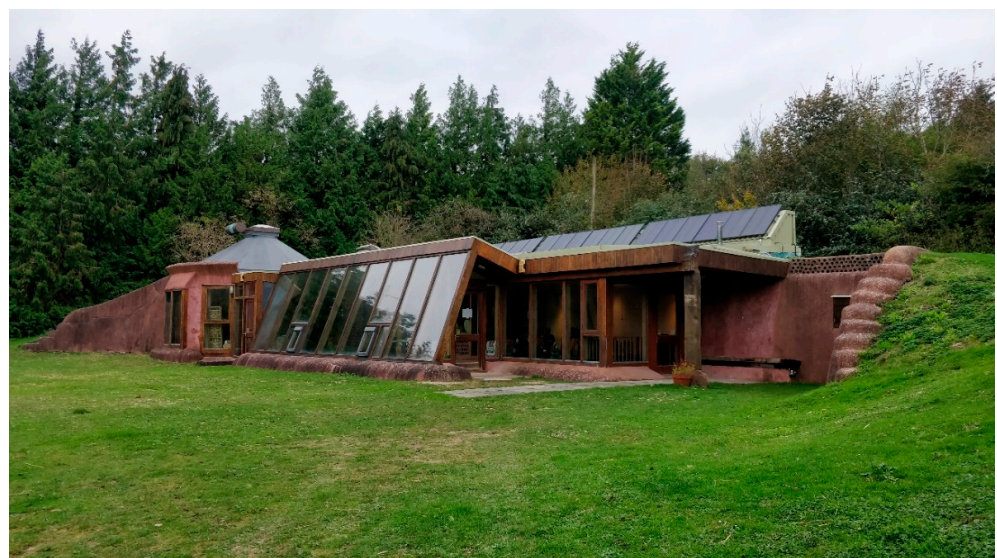
Figure 1. Photo of the Brighton Earthship (taken 03/11/2019) shows the south-facing glazing wall, angled for maximum solar gain, flanked by tire walls, and a roof that is topped with banks of photovoltaic solar panels.

Figure 1 shows a recent photo of the Brighton Earthship, nestled in its surrounding landscape of the South Downs National Park on the outer fringes of the city. The building has no foundations; rather, it is simply seated on undisturbed stable soil [50]. The front, south facing, aspect of the building shows the Earthship conservatory module (30 m 2 ), with an inner and outer layer of glazing (Figure 2a), which houses food-bearing planters fed by grey water recycling (Figure 2b). The left-hand side, west facing, module comprises a hut module (20 m 2 ), which is peaked with a skylight (Figure 2c). The rear, north facing, main nest module (84 m 2 ) encompasses a main activity room with more food-bearing planters, together with an enclosed kitchen and bathroom. The roof supports several banks of photovoltaic solar panels and captures rainfall, which is stored in underground tanks (Figure 2d). It also has solar hot water heating, plus a wind turbine for additional power.