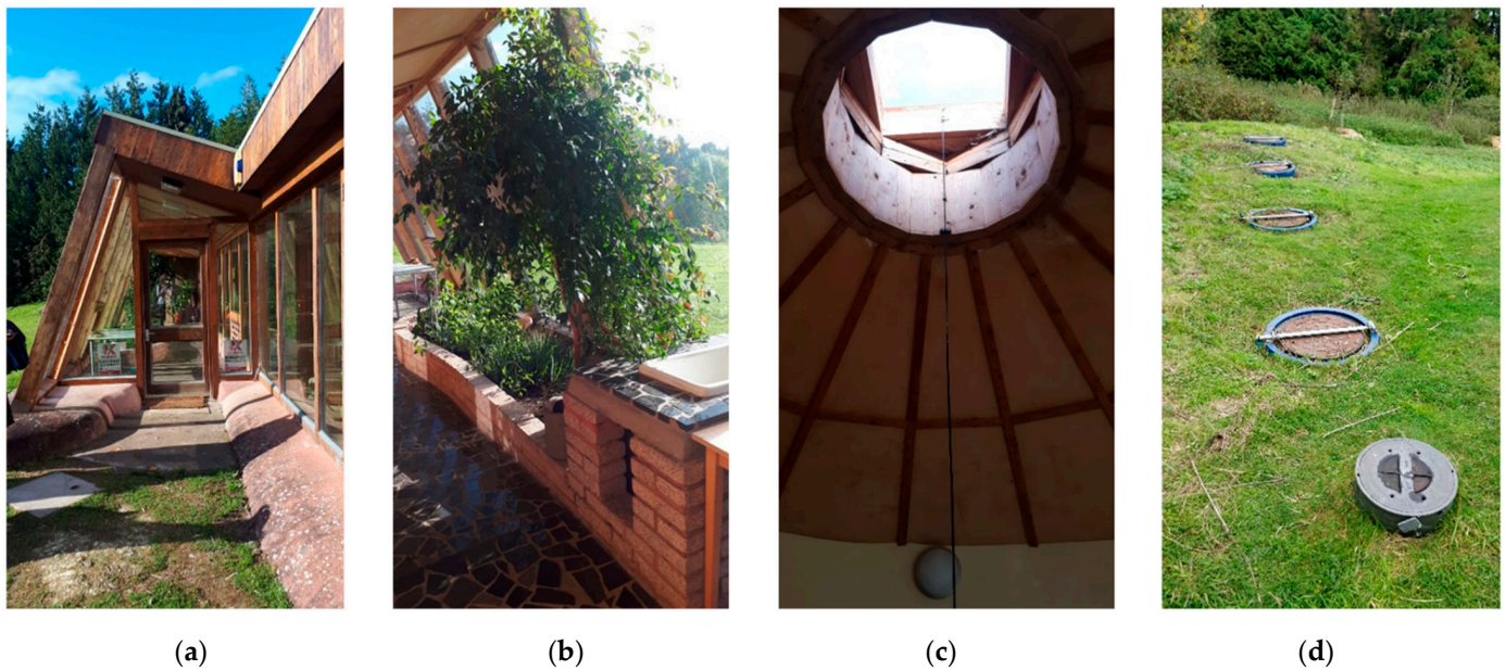
Figure 2. Photos inside and outside of the Brighton Earthship: (a) the entrance to the conservatory; (b) greywater harvesting system planters inside the conservatory; (c) sunlight beaming through the skylight; and (d) a collection of underground rainwater storage tanks.

The thermal performance of the building has been widely tested [7,50,51]. The latest works [50] suggests the building moderates external severe temperatures but, to reach satisfactory thermal comfort conditions during extreme cold snaps, some additional heating may be required (from occupants and powered appliances) or improvements made to the heat transfer from the conservatory.