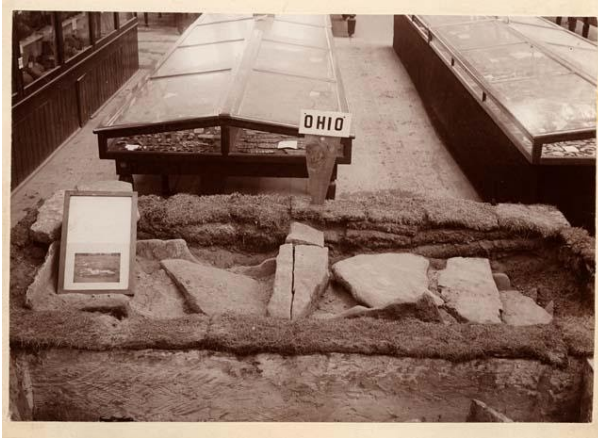
Figure 2: World's Columbian Exposition of 1893 reconstructed stone grave from Southern Ohio (Peabody Museum Collections Online, Peabody number: 47-41-10/99955.1.1).