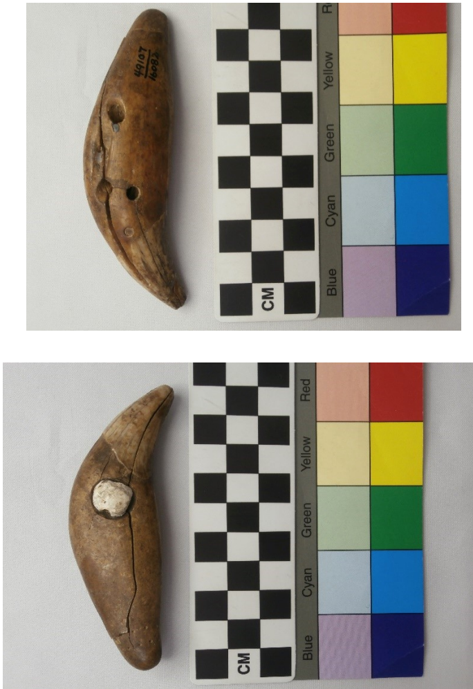
Figure 1: Two views of the Bear canine tooth with pearl object, MPM number: A 49107/16082.

Bears played an important role in Hopewellian iconography. Multiple bear paw shapes cut out of copper were recovered from the Hopewell site and others of this period. From other Hopewellian sites carved pipes were recovered with bear effigies. The design of a bear paw was even etched into a human femur found in Mound 25 of the Hopewell site (Berres, Strothers and Mather 2004; Greber and Ruhl 1989). Beyond iconography, bear regalia may have played a role in Hopewellian ceremonies. A Hopewellian stone figurine recovered from the Newark Earthworks of Ohio depicts an individual wearing a bear mask over their head, and bear claws over their hands. Similar bear regalia is