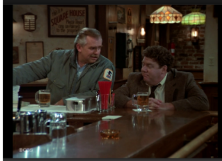
Figure 5. Screen Shot of Cliff and Norm, Cheers: Norm and Cliff's Excellent Adventure , (NBC television broadcast Dec. 6, 1990).

court had concluded that the robots did not look like the actors. 162 You can judge for yourself: