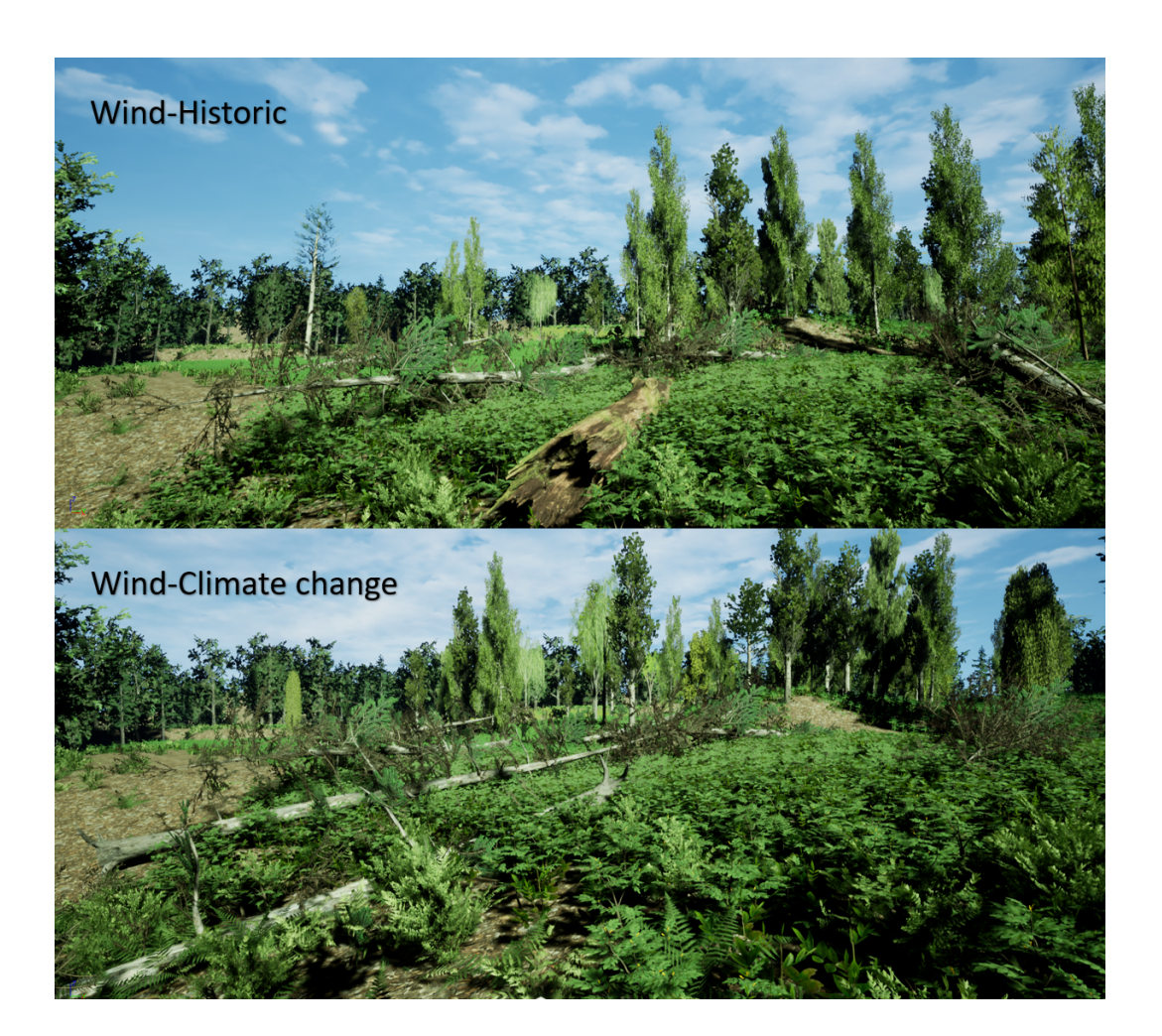
Figure 3: Forests are increasingly under stress from biotic and abiotic disturbances, including insects, windthrow, and climate. Among them, wind is a major ecological disturbance. We used a spatially-explicit, forest simulation model (LANDIS-II) to simulate how windstorms and climate change affect forest succession in 50 years into the future and developed a procedural modeling based workflow to create visceral experiences of different scenarios [23].

However, as much excitement as there is surrounding immersive technologies, we can also state with certainty that simply putting on a headset to experience three-dimensional data is insufficient or even counterproductive. We have diverging empirical studies that have shown the advantages and disadvantages of immersive experiences [16, 34, 39, 46]. Like any other communication medium in education, research, and decision-making, we need basic research that carefully examines the technology itself and its design choices. Comparable to the developing science around visualization, we need a science around