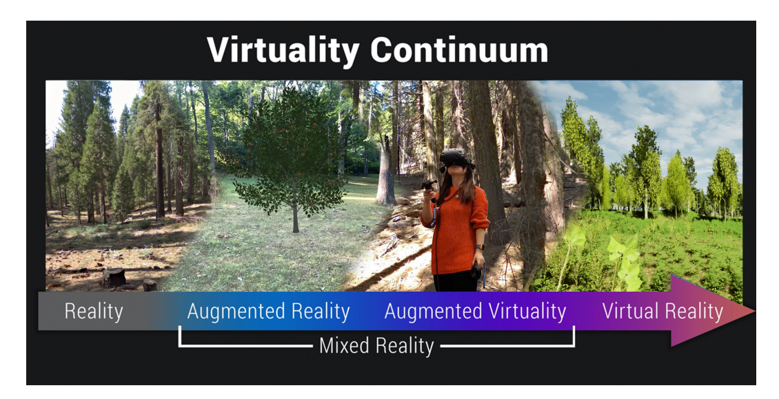
Figure 1: The figures shows a visualization of the virtuality continuum by [42].

"Immersive technologies" is an umbrella term for devices that deliver augmented, mixed, or virtual reality experiences. Researchers and industris may also use the terms XR, eXtended, or Cross-Realities when referring to immersive technologies (see Figure 1 for a visualization of [42]'s virtuality continuum). Augmented reality is defined as digital content superimposed onto the real world [62] [21], while virtual reality is defined as an experience without any access to our physical reality [4] [25]. Depending on the literature, mixed reality is either an advanced version of augmented reality that allows for tailored, three-dimensional integration of physical and virtual realities, or an umbrella term for all experiences that combine virtual and physical content [44] [42]. In case a virtual reality environment is experienced through a head-mounted display or cave, we use the term iVR to stress the immersive nature of the experience. There has been substantial debate and confusion about the terminology. I will briefly address some issues below, as clarifying any underlying concepts is essential for advancing the science of immersive experiences, including in the geospatial domain.