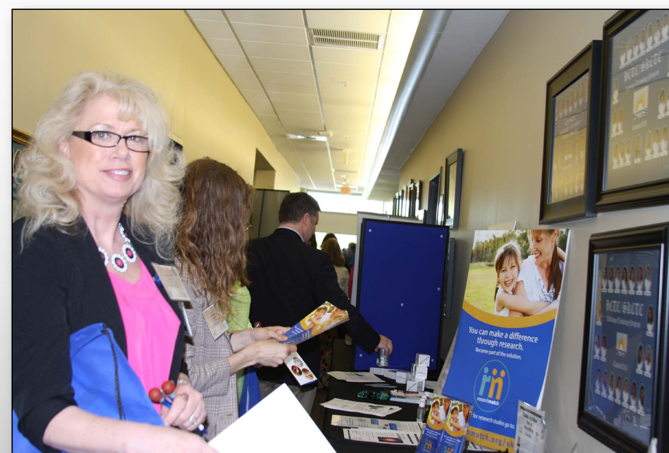
Research Recruitment Exhibits