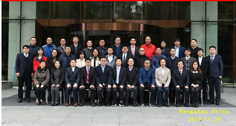
FIGURE 1 Launching ceremony of Food Frontiers

Web-based publishing also provides an opportunity for depositing large quantities of data, graphics (including color), and experimental details which are economically impractical to print.